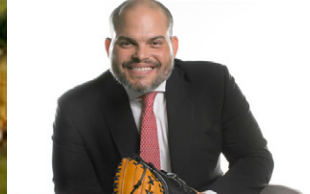
IVÁN "PUDGE" RODRÍGUEZ

• Retired NFL Outside Linebacker • NFL Draft 1981 / Round 1 / Pick 2 • NFL Most valuable player-1986 • 2x Super Bowl Champion NY Giants • 2x NFL Defensive Player of the year • 8x First team All-Pro