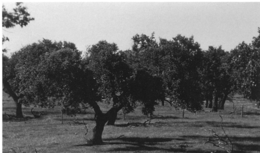
Widely spaced oaks in a pasture, Portugal. The tree canopy is pruned (debris beneath trees) to stimulate pasture growth and acorn production (for sheep and pigs).

Cato recommended making plaster from marble and quicklime, or from clay mixed with grain chaff and oil dregs. According to Cato, this mixture "does not allow mice and worms to be there and makes the grain solidier and harder." 49 He also described a pest repellent used for preserving lentils. The liquid was made by mixing vinegar, a solvent, with laserpicum , a gum resin with an acrid, bitter taste and strong odor. 50 Cato mentioned several ways that tree products could be used in human medicine. He recommended crushing juniper berries and mixing them with wine "if urine is passed with difficulty." He also suggested using boiled juniper wood for lumbago, myrtle for indigestion and