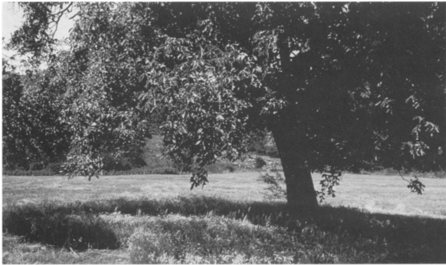
An old, isolated walnut tree in a wheat field in the Drôme Valley in France's Dauphiné Province. Before 1850, isolated trees in fields comprised most of Europe's agroforestry systems. The move to line planting of trees permitted mechanized agroforestry practices, where the main branches of trees were felled to allow harvesting under the crown. This particular tree was not shaped for mechanized harvesting.

Varro in his work De Civitate Dei . 62 While it is difficult to measure the impact Cato, Varro, Columella, and Pliny have had on Italian, other European, and North American agriculture over the past two thousand years, their treatises have probably been more widely read than widely used. Writing in 1725, the Englishman Richard Bradley noted: