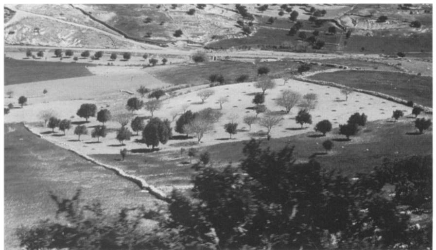
Traditional Mediterranean landscape in Agadir Province, Morocco. Almond, olive, and argan trees scattered throughout the area have multiple uses, but their main product is fruit. The trees are intercropped with cereals, mainly barley, or alfalfa.

During the 1940s, the concept of tree crops resurfaced in other temperate regions of the world. Botanist Constance Eardley discussed the suitability of carob, mesquite, and honeylocust as supplementary fodder for livestock in southern Australia. Several commentators described fodder trees useful as stock feed in South Africa, where large areas are often stricken with drought. A 1947 publication detailed uses of trees and shrubs as fodder, windbreaks, shade trees, and soil conditioners throughout the British Commonwealth. Italian observers described "coltura promiscua," a polyculture system in which pollarded