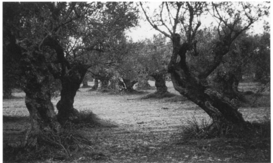
Old olive trees intercropped with durum wheat and ready for plowing in Greece's Macedonia Province. Intercropping was common in the Mediterranean until 1900. Photos accompanying this article appear courtesy of Christian Dupraz.

Some places are suitable at the same time for the planting of other crops; thus in young orchards, when the seedlings have been planted and the young trees have been set in rows, during the early years before the roots have spread very far, some plant garden crops, and others plant other crops; but they do not do this after the trees have gained strength, for fear of injuring the roots. 31