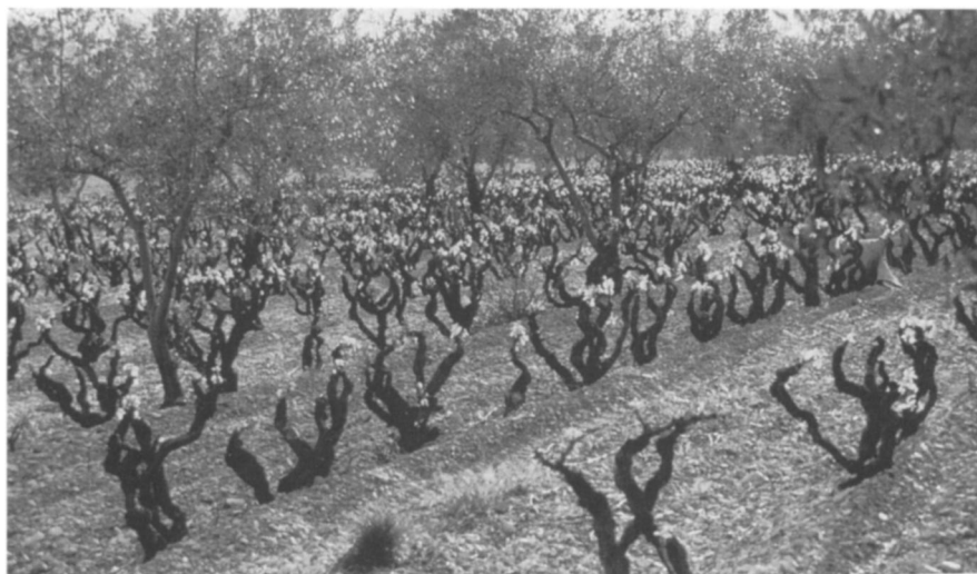
Intercropping of vineyards and olive trees, Alpes-de-Haute-Provence, France.

Over the past two thousand years, interest in the works of Cato, Varro, Columella, and Pliny has surfaced and resurfaced among agriculturalists, naturalists, and Latin scholars. 60 Varro quotes Cato frequently, and Columella refers often both to Cato and Varro. In the fourth century, Palladius "supplied the hornbook used by the agricultural monks throughout the Dark Ages," apparently basing much of it on the Roman agriculturalists. 61 In the first half of the sixth century, Isidore of Seville wrote a voluminous encyclopedia that was partially attributed to Varro's earlier work, and St. Augustine made frequent reference to