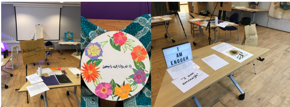
We used creative arts and imaginative ideas to prompt thinking.