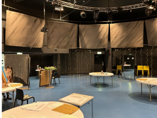
The venue at Hallam with stations across the room.

Some photos of the stations the face to face workshops that were held events at Sheffield Hallam on 22 nd November, SACHMA on 1 st December and Firvale Community Hub on 20 th February the events are below.