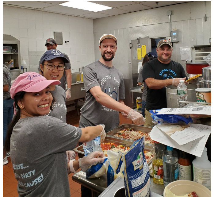
Volunteers from Alnylam take part in a recent Cookin' With CASPAR dinner service.