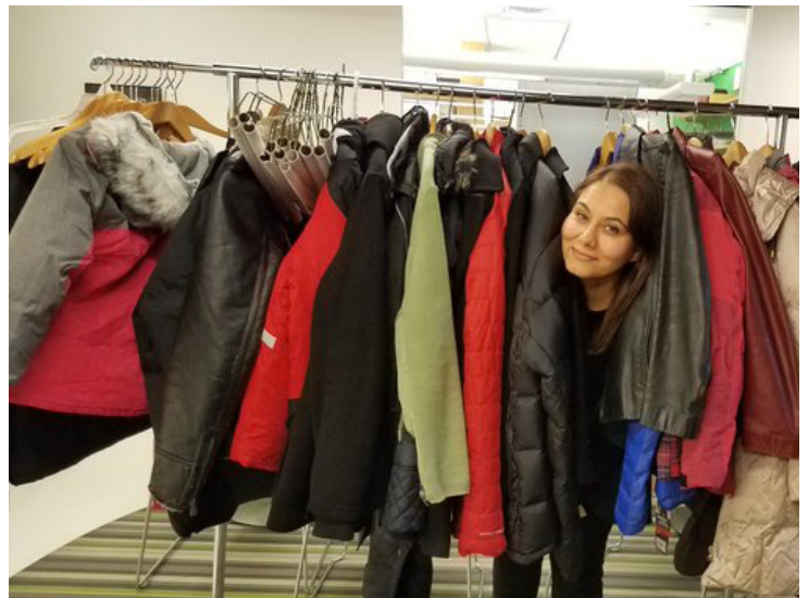
(Below): Winter coat donations from the generous folks at LabCentral helped keep the people we serve warm throughout the cold weather months.