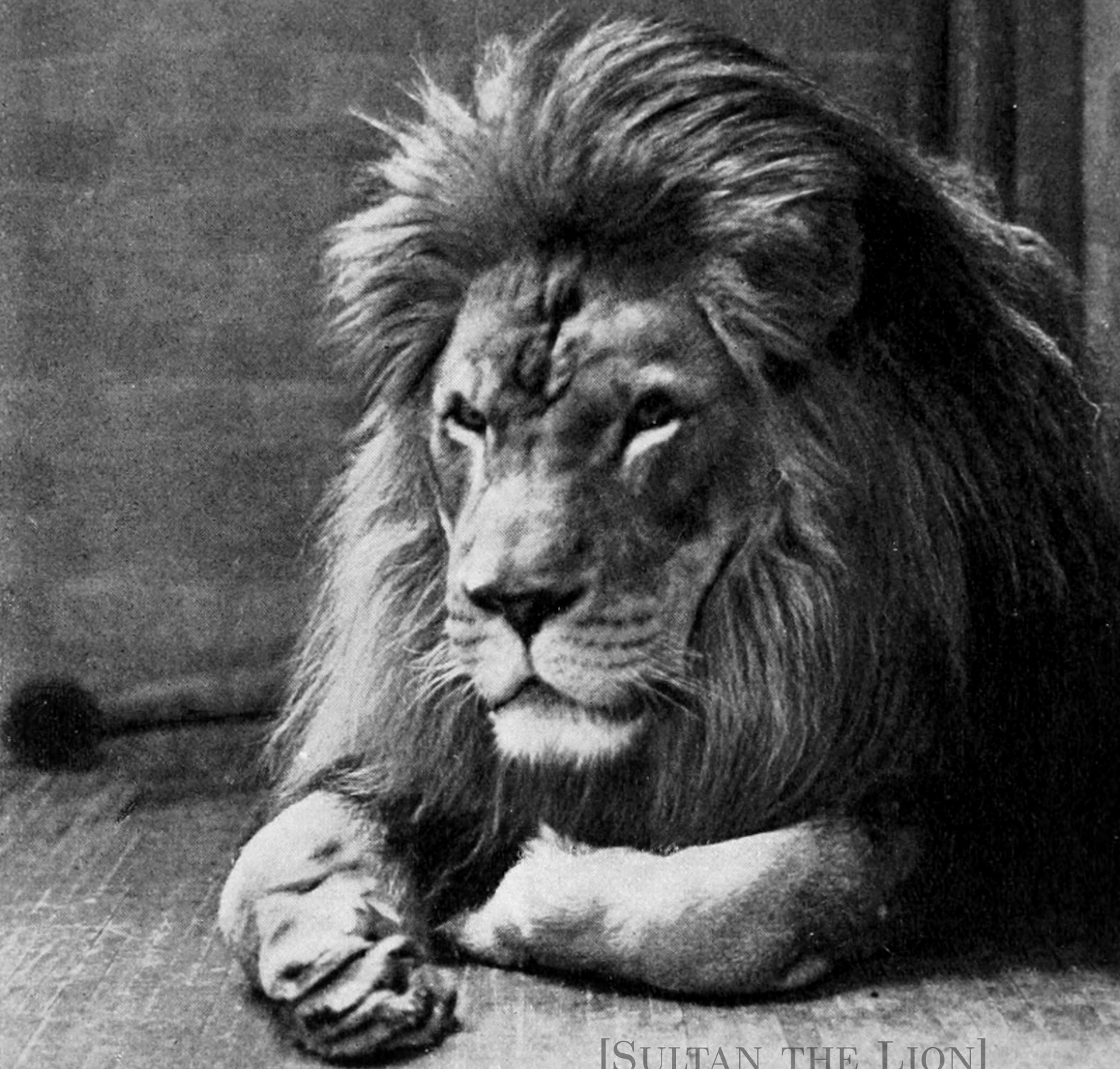
[SULTAN THE LION]