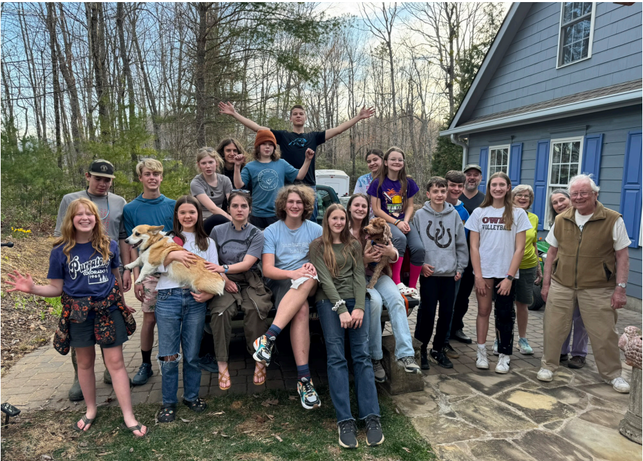
Youth volunteered to help the Deck the Trees committee with moving Christmas Trees while the Monte Vista is being remodeled.