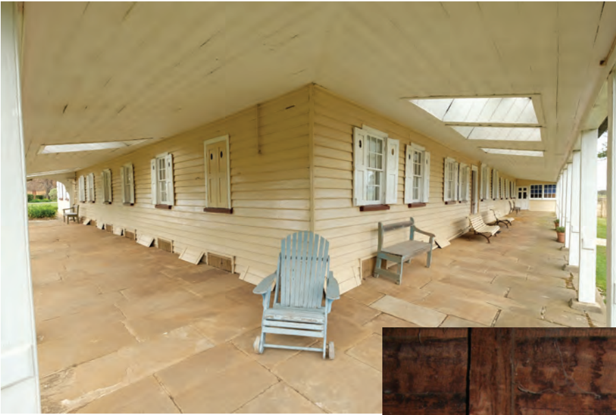
Top: Woolmers Homestead, built about 1820.