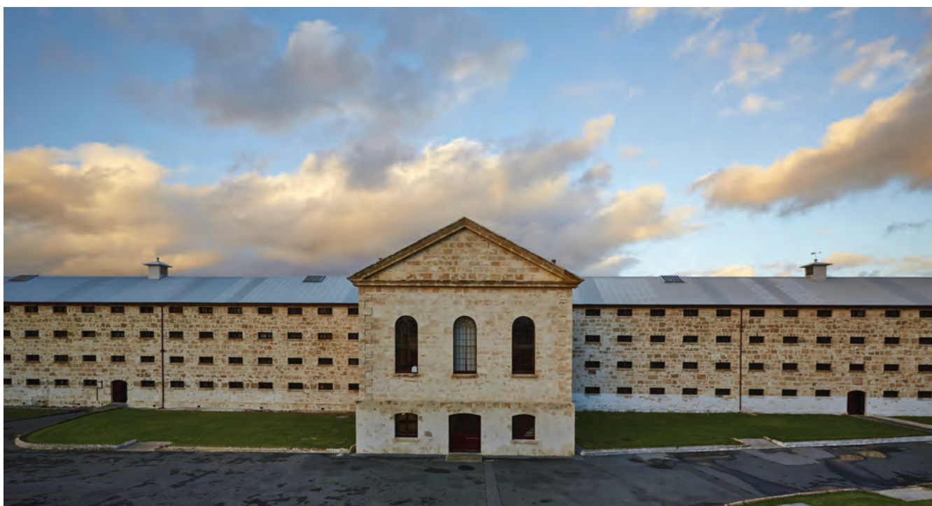
Fremantle Prison.

In addition to the Framework, the work of the ACSSC is guided by several documents including the ACSSC Meeting and Membership Guidelines (2021) , the ACSSC Annual Work Plans , and the ACS Corporate Identity Guidelines (2022) .