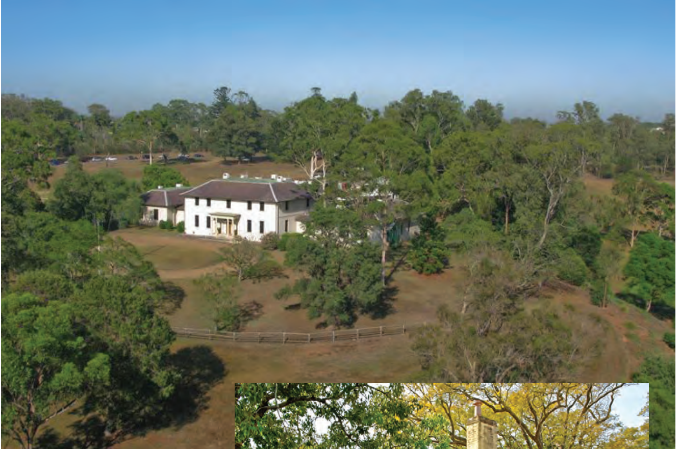
Top: Old Government House and Domain, Parramatta Park.