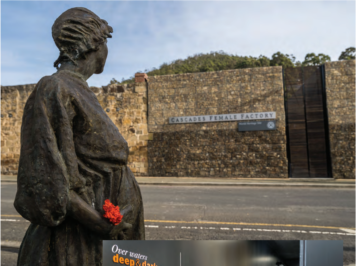
Top: Cascades Female Factory Historic Site, South Hobart.