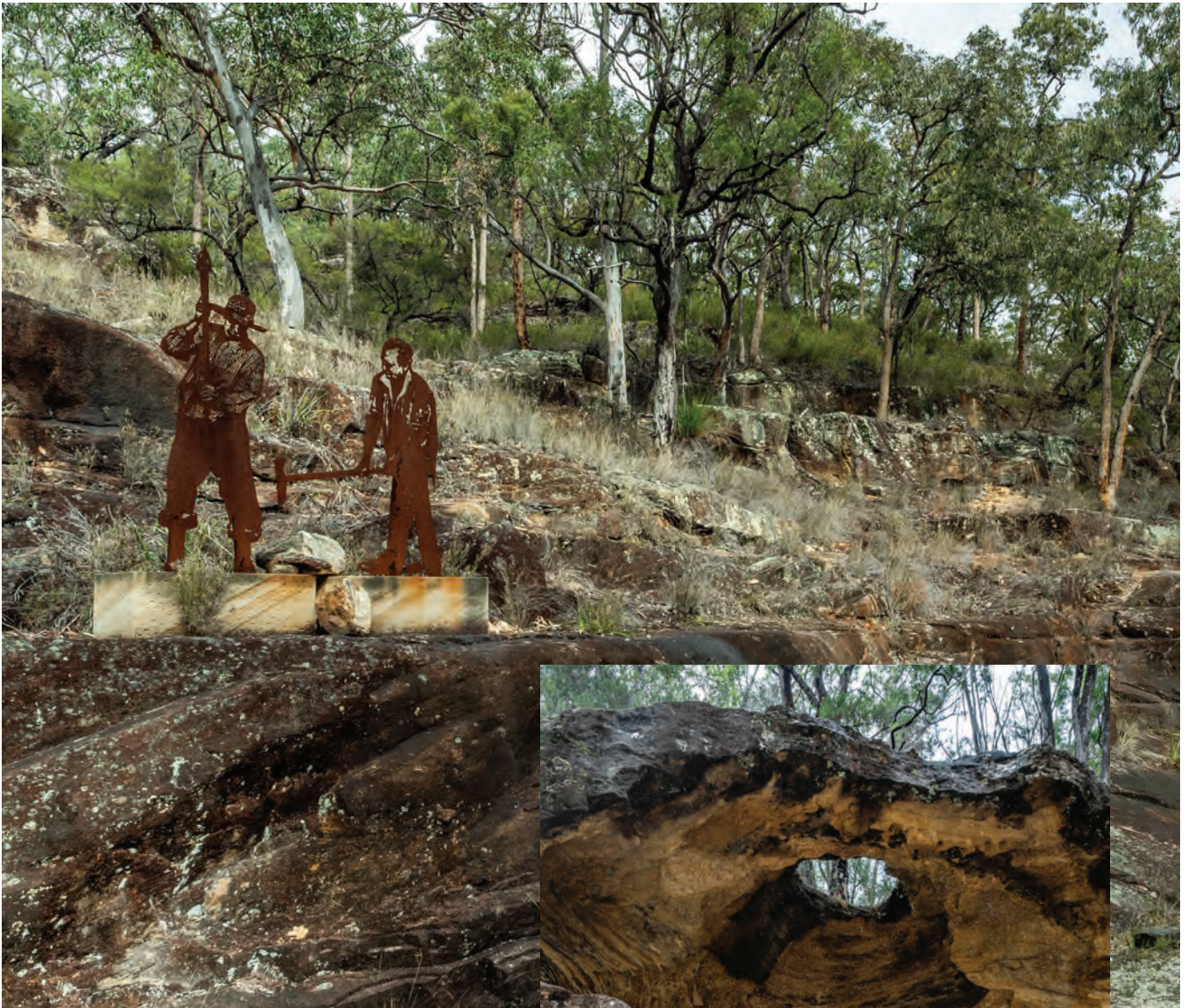
Top: Interpretation at Old Great North Road, Dharug National Park.