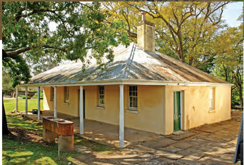
Bottom: Dairy Cottage, Parramatta Park.