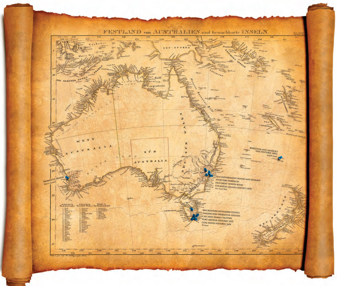
Adapted from original map by F. von Stulpnagel, Festlands von Australien und benachbarte Inseln , 1841.

While many of the sites are owned and managed by Commonwealth or State Government agencies, Old Government House is managed by the National Trust of Australia (NSW), Woolmers Estate is owned by a public trust and Brickendon Estate is privately owned and managed. The sites are uniformly protected by the national Environment Protection and Biodiversity Conservation Act 1999 and managed according to the Australian Convict Sites Strategic Management Framework (the Framework). They are also governed by different State legislative regimes.