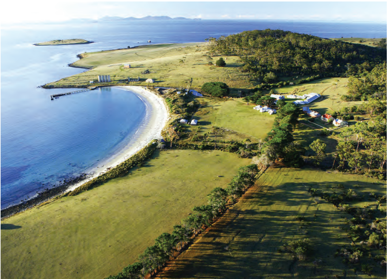
Darlington Probation Station, Maria Island National Park.

Criterion (vi): The transportation of criminals, delinquents, and political prisoners to colonial lands by the great nation states between the 18th and 20th centuries is an important aspect of human history, especially with regard to its penal, political and colonial dimensions. The Australian convict settlements provide a particularly complete example of this history and the associated symbolic values derived from discussions in modern and contemporary European society. They illustrate an active phase in the occupation of colonial lands to the detriment of the Aboriginal peoples, and the process of creating a colonial population of European origin through the dialectic of punishment and transportation followed by forced labour and social rehabilitation to the eventual social integration of convicts as settlers.