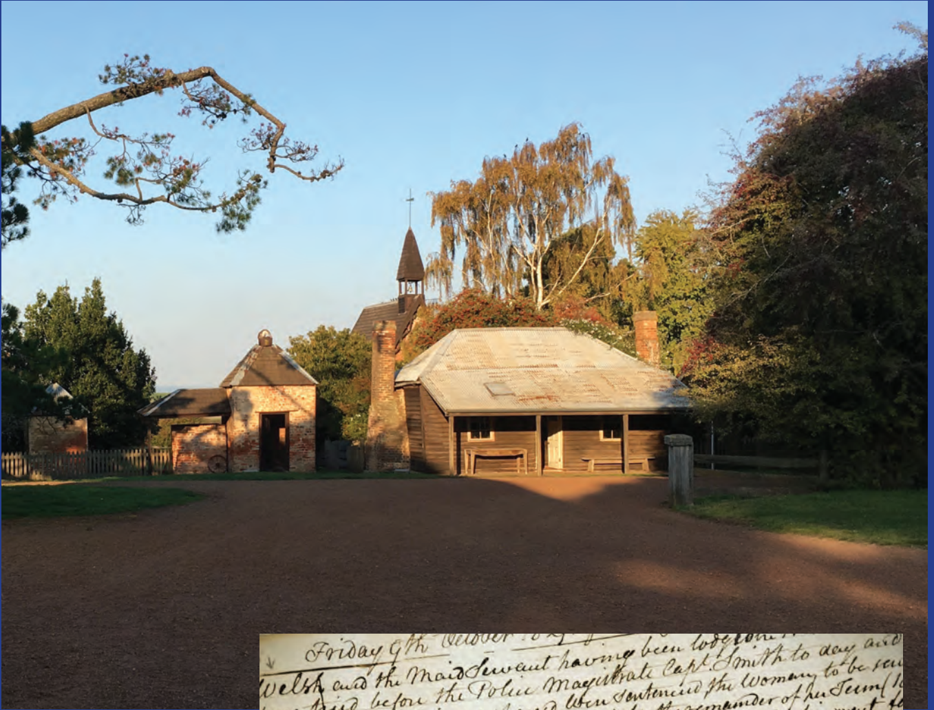
Top: Brickendon Farm Village, Brickendon Estate, Longford.