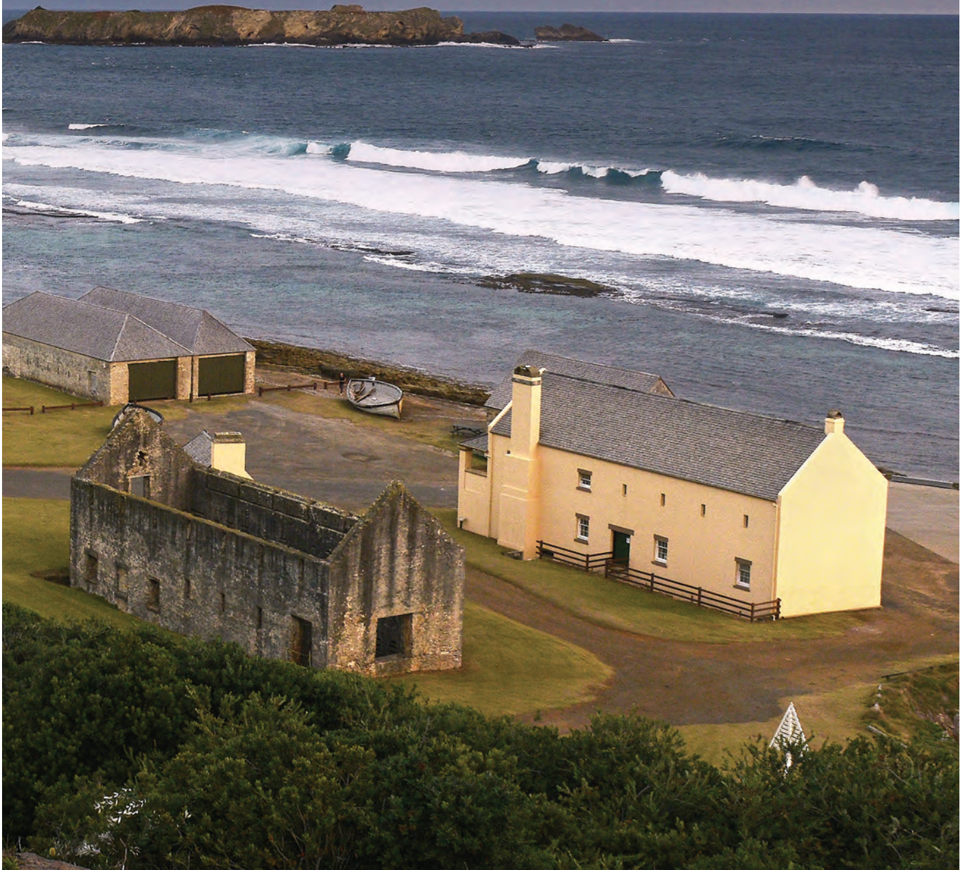
Kingston and Arthur's Vale Historic Area, Norfolk Island.