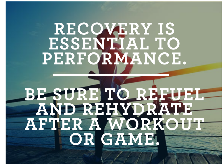
Table 6: RECOVERY SNACK IDEAS

Consume 1-1.2 g of carbohydrates per kilogram body weight per hour for the first four hours after glycogen-depleting exercise. Be sure to rehydrate as well (see Table 12).