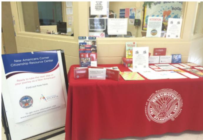
City of Atlanta's "Citizenship Resource Corner"

Promotion of citizenship and available related resources is done every single time a Welcoming Atlanta representative speaks to the media. This past year Welcoming Atlanta and citizenship resources have been highlighted in five separate media interviews and in a Citizenship Public Service Announcement that runs on a local channel once a month.