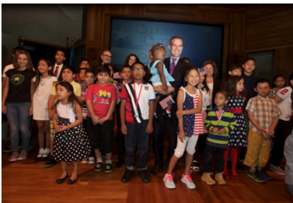
LA Mayor Eric Garcetti Children's Naturalization Ceremony, September 17, 2015

Step 6: Provide access to the library community rooms for non-profit organizations so they can host Citizenship and English language workshops on-site.