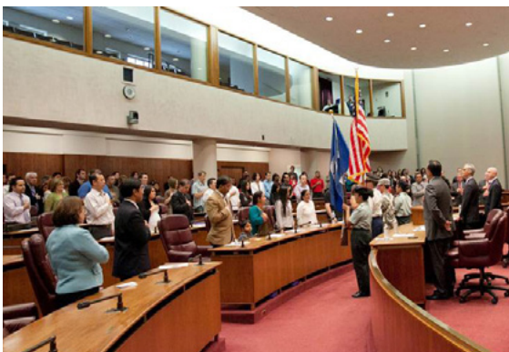
Chicago Mayor Rahm Emanuel at an Oath Ceremony in City Hall

"We want to make sure our residents have the resources they need to become naturalized citizens. By providing free assistance to residents in their native language, we can point them in the right direction so that they can continue on their path to citizenship and protect them from any risk of consumer fraud. Chicago is a city that was built by immigrants and continues to thrive from the vibrancy of our immigrant population, and we will do everything we can to support immigrants in their quest for citizenship." - Mayor Rahm Emanuel