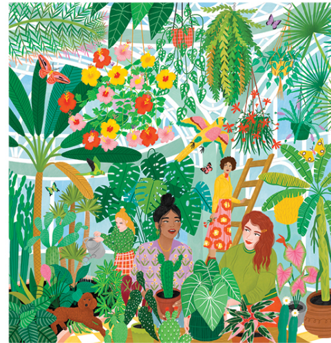
↑ Client: Eeboo Title: Plant Ladies Project: Jigsaw puzzle design Material: Digital