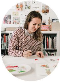
↑ This is a portrait of me in my previous studio that I shared with about 7 other freelance creatives. I have renamed this place for around 5 years.