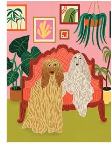
↑ Client: Red Cap Cards Title: Afghan Dogs Project: Greetings card design Material: Digital

I'm very spoiled when it comes to compliments! A few weeks ago I received an email from a dad who purchased an original painting on my online shop for his daughter who was about to turn 8 years old. Throughout lockdown she had been redrawing my illustrations with her colored pencils. He sent me several pictures of her recreation and it was just so incredibly cute!