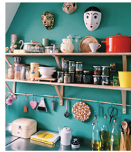
↑ My home kitchen. I love cooking and I spend a lot of time here. This is my ultimate relaxing moment after a day of work. It's meditative to me.

When was the last time you felt frustrated? How did you overcome it?