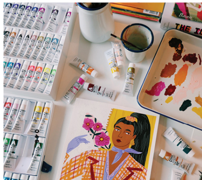
• Painting in progress in my studio. When I started as an illustrator I hand painted everything with gouache or water colors. Now I create all my illustrations in Procreate on the iPad. But I still love painting in the time that I have left. Acryla gouache by Holbein is my favorite brand.

No, in fact I've started my Instagram just to document my art school graduation process. I've always kept diaries and documenting through Instagram just comes very natural to me. I love it! I've never used hashtags or changed the content I wanted to share based on the engagement. I just share what I think is cool.