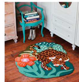
↳ Lovely Leopard, a super soft rug from my first rug collection. Available at bodiljane.com/rugs. They are created in collaboration with the fabulous crafts(wo) men of Stitch, based in Casablanca, Morocco.

Probably not much will change. I can imagine myself having a bigger studio and buying my own apartment, but I haven't made up my mind about the location yet. I would also love to get a driver's license and a miniature poodle. I'm already dreaming about driving to the beach with my puppy on the backseat!