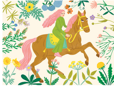
↑ Client: Red Cap Cards Title: Horse Child Project: Greetings card design Material: Digital

Is there any compliment you received that cheered your day up recently?