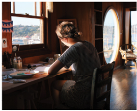
• Self-portrait of me in my room at the houseboat of Varda Artists Residency where I stayed for one month in 2016. I had the honour to be invited to stay at the houseboat and create art there. It was a very exciting trip for me, traveling all alone to San Francisco.