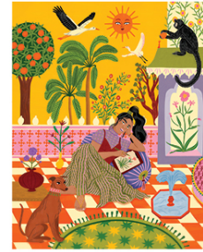
↑ Client: Ordinary Habit Title: Indian Garden Project: Jigsaw puzzle design Material: Digital