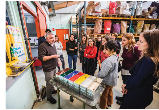
↑ Swiss pencil brand Caran D'Ache invited me to visit the pencil factory in Geneva. I'm all the way at the right. It was so cool to see the old factory and how the pencils are made. It's a magical process! I've been using Caran D'Ache pencils since I was a little kid and this was just a dream trip to come true.