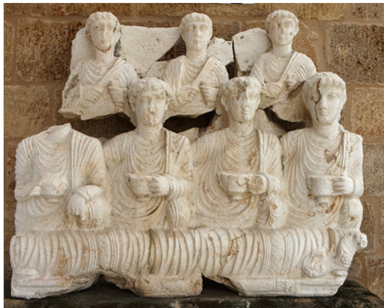
Limestone funerary relief Plamyrene, 1st-2nd Century AD