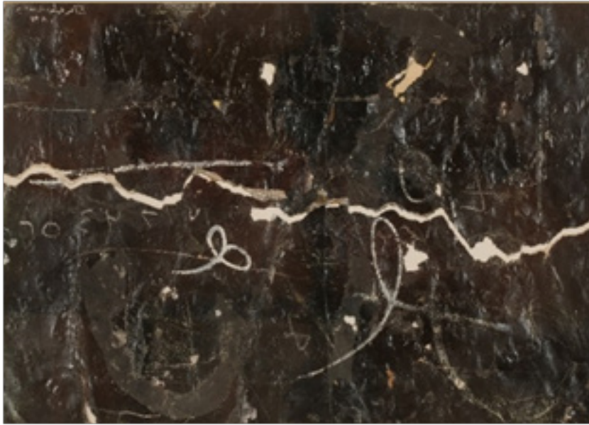
Shaker Hassan Al Said | Untitled