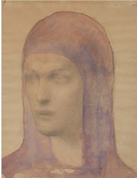
Khalil Gibran Watercolor on paper 29.7 x 22.3 cm © 2018 NABU Museum