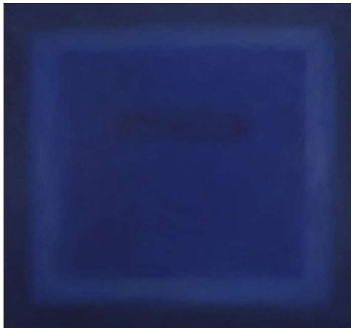
Helen Khal | Blue