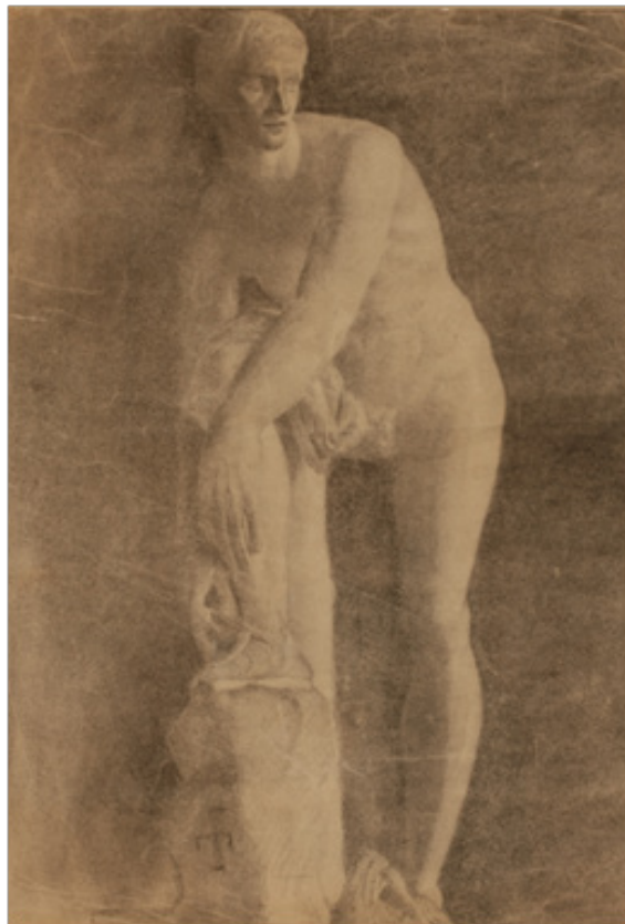
Saliba Douaihy | Study of a man Charcoal on paper 61 x 42 cm © 2018 NABU Museum