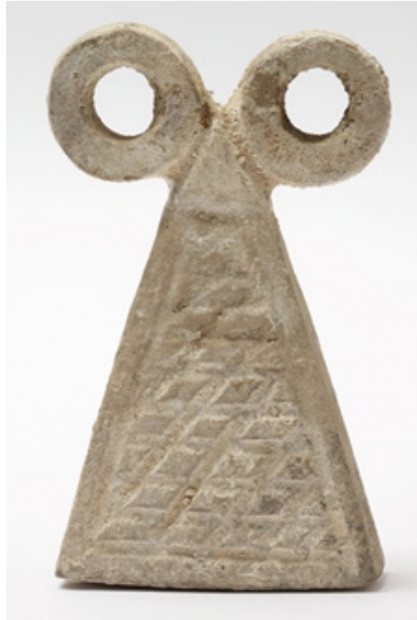
Alabaster Eye Idol 2nd half of 4th century BC 13.9 cm