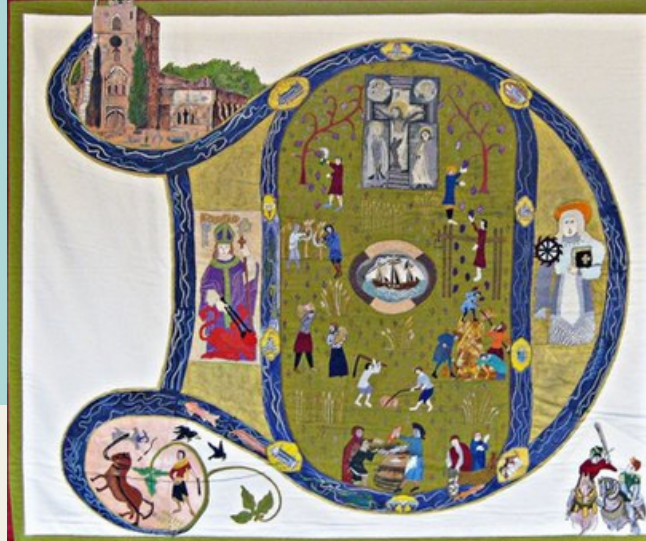
A piece from our founding project - Tapestry for the Millennium

When social distancing is over and it's safe to meet, this will give people some desperately needed social contact.