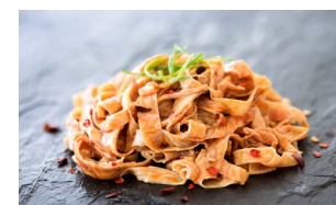
SPICY YUBA NOODLES

Food Service Case: 3 x 1 lb. UPC: 850565007057 Shelf Life: 10 days