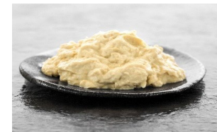
KUMIAGE YUBA (NO. 1)

The earliest harvested yuba - unctuous, rich and creamy with a smooth texture similar to burrata. So delicate it's notoriously difficult to harvest and can only be gathered with a scoop. Rich flavor & luscious texture for savory and sweet applications.