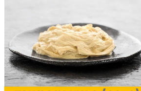
TSUMAMI YUBA (NO. 2)

Food Service Case: 2 x 2.5 lbs. UPC: 853404002275