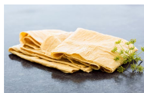
YUBA SHEETS (NO. 4)

Food Service Case: 3 x 1 lb. UPC: 850565007040 Shelf Life: 10 days