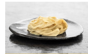
HIKIAGE YUBA (NO. 3)

Food Service Case: 3 x 1 lb. UPC: 850565007033 Shelf Life: 10 days