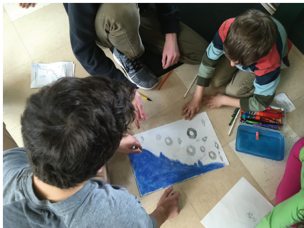
What's the Bigger Picture? Narragansett High School and Narragansett Elementary students creating artwork from climate change graphs.

move along a game board. Real world scenarios are built in to help students understand the unique predicaments that researchers experience in Polar Regions. For example, the research ship can hit an iceberg and players have to move back three spaces in the game. As they complete the game, students are directed to a particular Polar-ICE data story to investigate interviews with scientists and learn more about polar research. In the third and final portion of the lesson, the students create a "Fund My Research" page to pitch their research plan and secure funding just as real scientists do with funding agencies. Through short pre- and post-tests, the students demonstrated an increased knowledge of Polar Regions and an improved attitude about the importance of better understanding these areas.