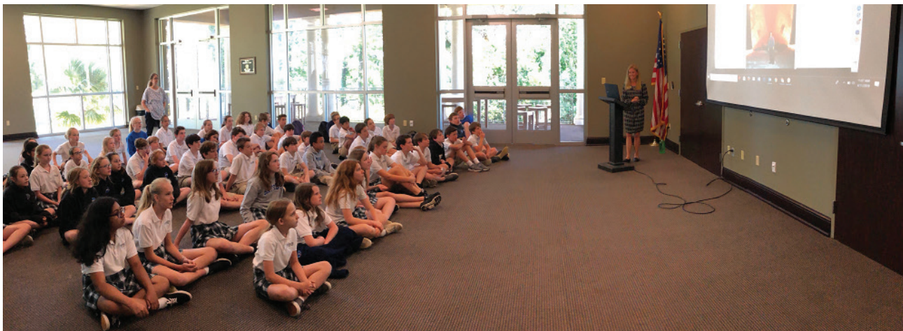
Bayside Academy students at SOCCOM float telepresence.

game play into the learning cycle, teams of students challenged each other in the Polar Play activity. The game board activity reinforced the newly learned Polar Science content and the complexity of planning a research expedition to the Polar Regions. Students also learned firsthand the art of science communication by participating in a live broadcast by URI's Inner Space Center ( http://innerspacecenter.org/ ). To expand the reach of the project to other high school students, each NPP student crafted a personal Arctic message, describing their vision for the future of the Arctic. The culminating activity occurred when the students returned to their high schools where each team hosted a live video conference with NPP scientists, highlighting the project and their personal Arctic message. Students in any school or classroom could conduct a similar activity and choose a personal message from research and organize their own community presentation.