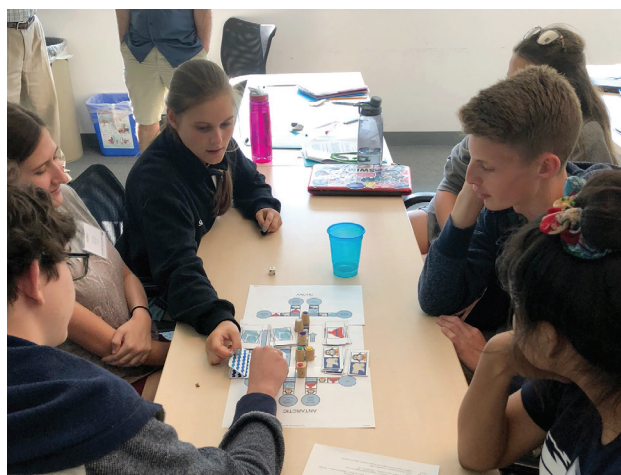
Northwest Passage Project High School Academy students playing the Polar Play game.

Integrating polar and climate science into the existing curriculum is an oft-cited challenge for teachers. However, the current climate crisis demands that students understand and appreciate the unique environments of the Arctic and Antarctic. These resources are important because they support and promote Polar Science content. They also incorporate the 20th century skills of critical thinking, creativity, collaboration, and communication which gives them added value in a science curriculum. These activities are simply starting points for teachers to help students on their journey of discovering these vital regions. One of the most rewarding results of these Polar Science resources was seeing students make unique connections with the Poles. Learning was evident when high school students took the information from a polar workshop and turned it into an impactful