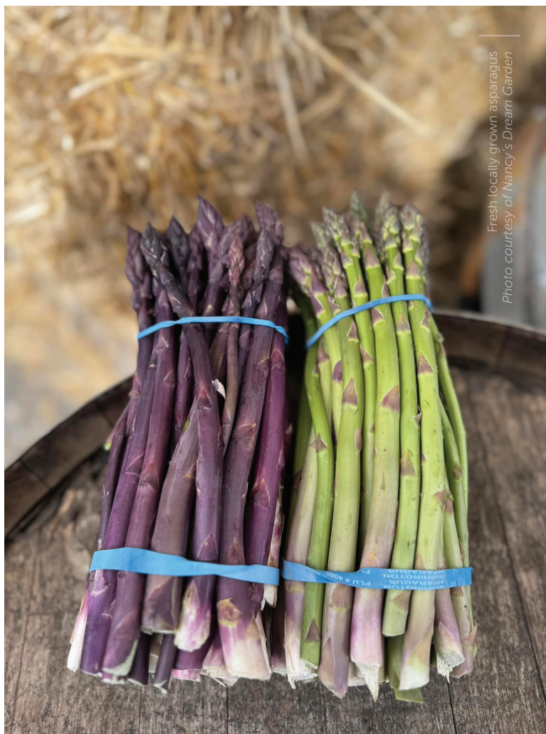
Fresh locally grown asparagus