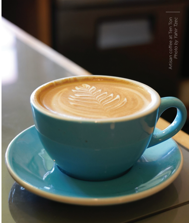
Artisan coffee at Ten Ton