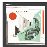
SP1199 Strange Peace CD / LP / CS