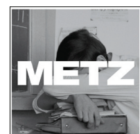
SP1015 s/t CD / LP / CS