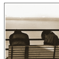
SP1120 II CD / LP / CS