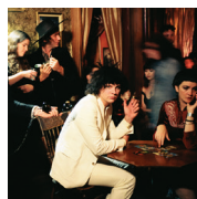
SP1221 Full Circle Nightmare CD/LP/CS