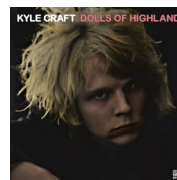
SP1164 Dolls of Highland CD/2xLP/CS