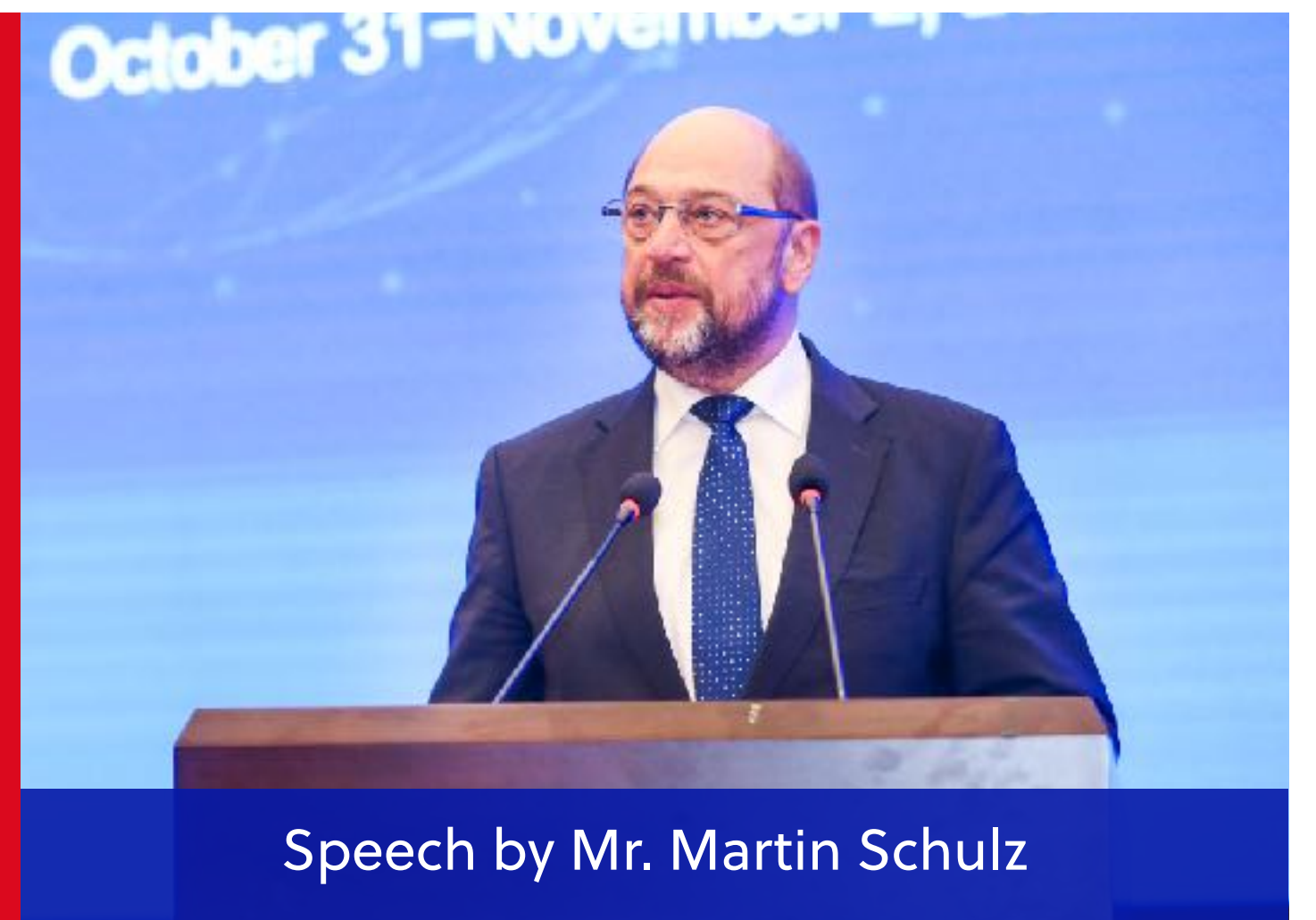
Speech by Mr. Martin Schulz