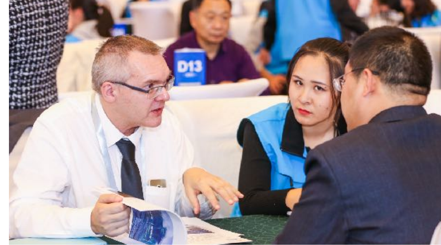
European Participants in discussion with their potential cooperation partners ▲

Cooperation requirements of both sides had been collected in advance.