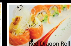
Red Dragon Roll