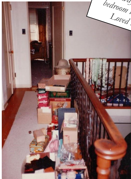
Hallway with Grandma's bedroom in the background Loved the banisters!