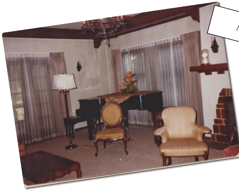
Living room. Dad learned to play on that piano

The house was in disarray that day, but I'm glad I snapped a few photos