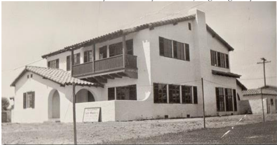
And another angle with more of a view from the side of the house. July 1934

If you look closely (and with help from the zoom tool), you can see the sign that shows it was built by Taylor Wheeler Builders. I wonder if they'd moved in yet or were just getting ready.