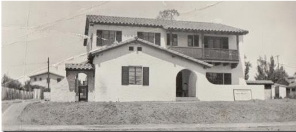
Front of house at 1549 N. Echo Avenue, Fresno, California July 1934