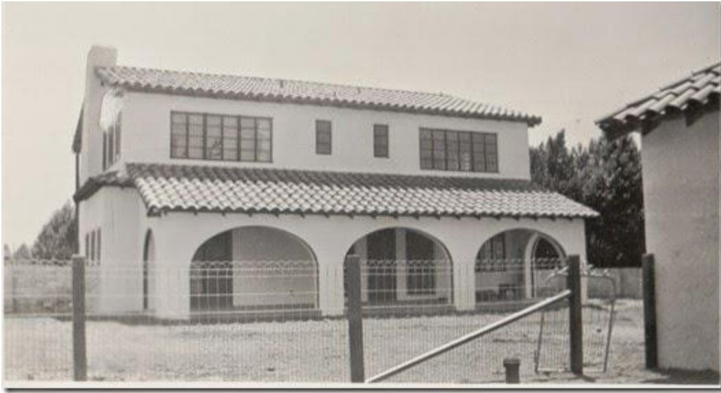
And a view from the back. Notice the trees along Carmen Ave to the left rear. July 1934

The room upstairs with the balcony was my Uncle's bedroom with windows both on the balcony and on the side of the house. My dad's bedroom was upstairs on the corner in the back. What's interesting is that the three corner windows on the first floor on the side corner were about where the den would have been. And I always remember that den being very dark without any windows on that side – did they remodel at some point and cover those windows up? I do remember that was the wall where the cuckoo clock hung (that bird was NOISY!) and there were no windows there. Maybe my cousin who knows the people who own the house today can confirm that for me.