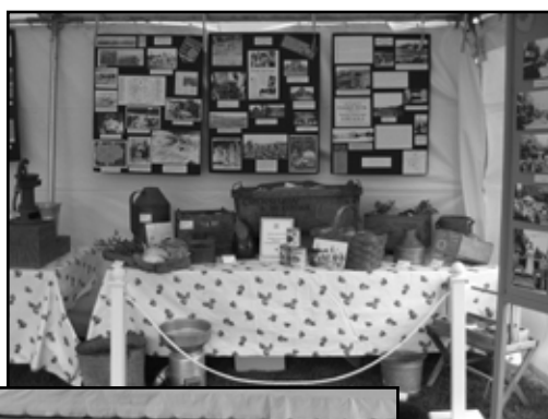
Right: Mini Museum Exhibit '07 Strawberry Festival