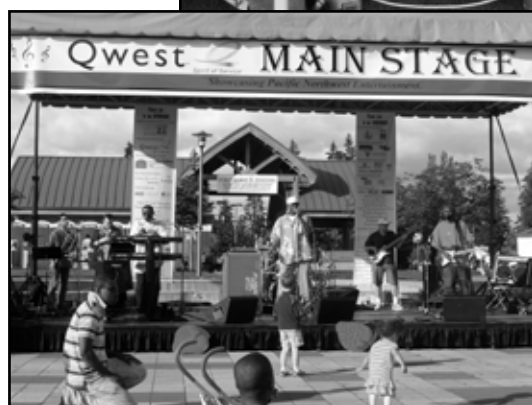
Left: Qwest Main Stage '07 Strawberry Festival