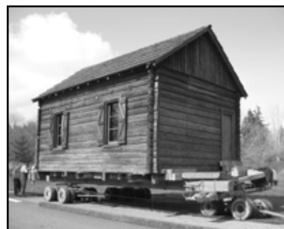
Fraser Cabin on wheels. April 4, 2008