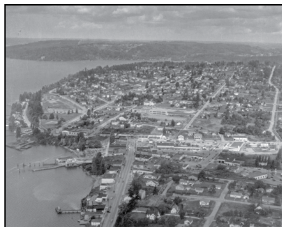
Above: Central Kirkland, ca. 1940. L90.18.3