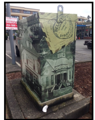
Above: Utility Box on Main Street in Bellevue wrapped with historic photos.

We also ask that you think of the Bellevue Strawberry Festival when filling out cultural events that you have attended in Bellevue. An important part of the Strawberry Festival is telling the story of how it began. Strawberries were abundant in 1925 when the festival began, largely because of the Japanese immigrant farmers who were the primary harvesters of the crop. You can read about the history of the Strawberry Festival