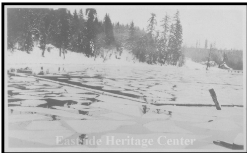
Above: Lake Washington at Juanita Beach Park c. 1916 at winter. It was so cold frozen pieces of ice floated in the lake.

On another chilly winter day in the 1950s, it snowed many inches on the Eastside. Buildings and homes were blanketed in snow. One of the snow covered buildings was the Old Highland School, which was of Bellevue's