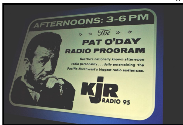
Above: 2016 Benefit Dinner, a slide of famous Seattle on-air personality Pat O'Day from KJR 950.