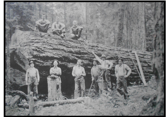
Above: A photo from EHC’s collection used in a TELOS class presentation on logging, taken in 1925.

To find out more about Bellevue College’s TELOS program, visit their website at: