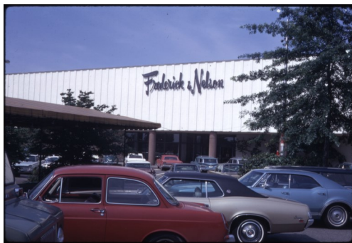
Above: At the 2012 Benefit Dinner, guests played an interactive game of Eastside trivia. This photo of Frederick & Nelson in Bellevue Square c. 1969 was one of the photos used for a question, EHC #1998.25.22.