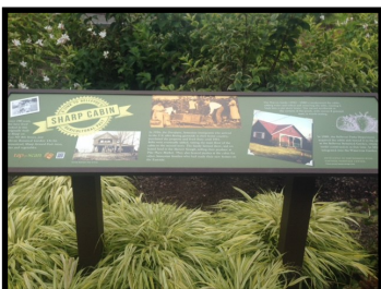
Above: Interpretive signage for the Sharp Cabin at the Bellevue Botanical Gardens.

The City of Bellevue is currently working on a project called the Grand Connection, that will be a pedestrian-oriented, non-motorized corridor beginning at Meydenbauer Bay Park and connecting to the Eastside Rail Corridor. Art and culture are a