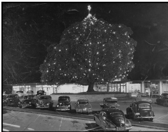
Above: The Madrona Tree outside the Crabapple Restaurant at Bellevue Square was decorated with lights every holiday season, to the delight of residents and shoppers. The Crabapple opened in 1946, and operated until 1975. #1997BHS.027.008

The exhibit includes photos and artifacts donated by Eastside residents and businesses, of holidays spent on the Eastside.