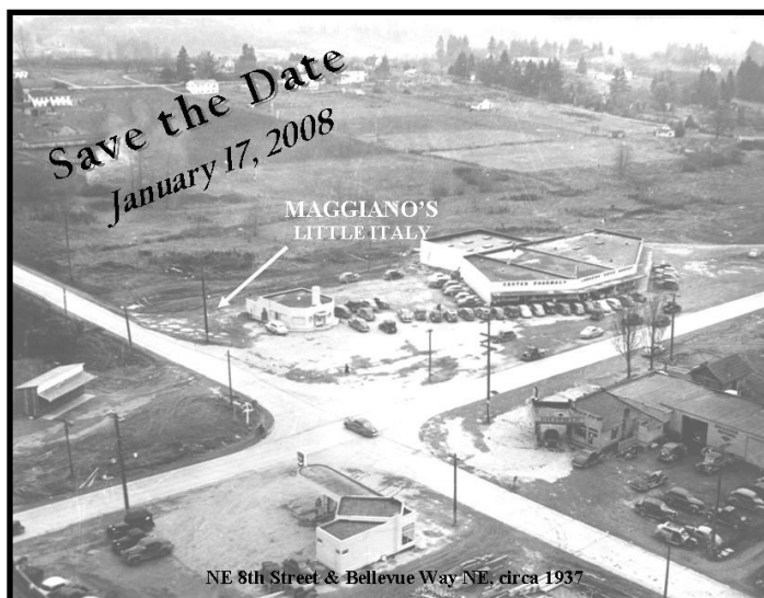
Above: The save the date card for the first Eastside Heritage Benefit Dinner. The photo used is of NE 8th St. & Bellevue Way NE, c. 1937.

The first Heritage Benefit Dinner was held on January 17 th , 2008 at Maggiano's Little Italy in Bellevue. The fundraising goal for this event was $20,000. The following year, the event was held at Meydenbauer Center, which would continue to be the venue for the event to the present day.