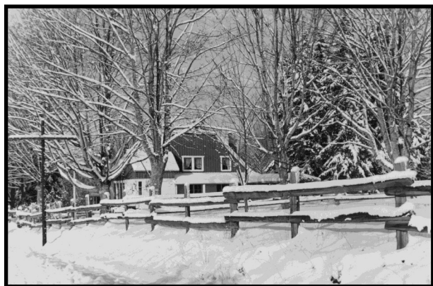
Above: Old Highland School covered in snow c. 1955.

You can find more photos of past Eastside winters, and many other photos relating to the Eastside on EHC's website at: www.EastsideHeritageCenter.org/Gallery and visiting the KC Snapshots page.