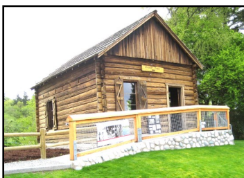
Above: The Historic 1888 Fraser Cabin at Kelsey Creek Farm.

Saturdays at Fraser Cabin begins with Sheep Shearing on April 30th and continues on the third Saturday of the month until Farm Fair on October 1st. You can help any of these days from 11:00am – 3:00pm, and 11:00am-4:00pm on Sheep Shearing and Farm Fair.