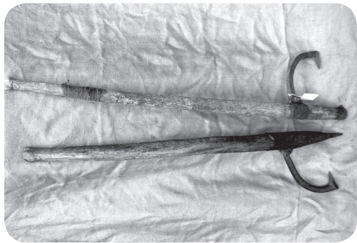
The cant hook and the peavey

This issue, we are featuring two artifacts from our lumbering tools collection: the cant hook and the peavey. These two are often confused, because they not only look similar, but are used in similar ways. Their differences are evident in the photo.