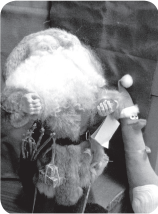
Two Northwest Santas – The beautiful Washington State Santa, on the left, carries salmon and apples and stands with one foot in Western Washington and one in Eastern Washington. The silly Santa to the right is a large clam from the Pacific Northwest called the Goey Duck wearing a little Santa hat.

The large collection soon became famous and people would drive from all around for a special tour from "the Santa Lady." The collection was even featured in several KOMO news stories and on the nationally syndicated TV program "Real People."