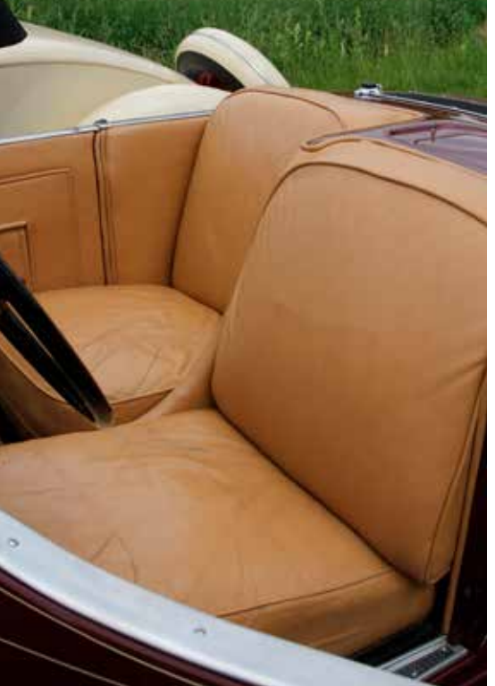
Of the five different body styles offered for the 734 series of 1930, only the two-passenger runabout (boattail) featured the staggered seating. "The driver's seat being placed slightly forward of the passenger's seat, s in a racing car to insure the driver against any interference when traveling at high speed." — PACKARD NEWS SERVICE

Speedsters from most any company at that time were never inexpensive; Packards were no exception.,As the Great Depression waxed, the market for luxury autos withered. Speedsters were but a minor player in this high-priced group and would soon become a victim of the Threadbare Thirties era of stodgy, characterless automobiles. All of the above trends contributed to the relative obscurity and low production of this model, which, ironically, have made them so valuable and sought-after today!