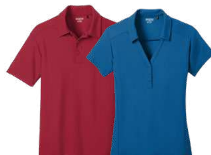
OGIO® FRAMEWORK POLOS 4.2-ounce, 100% polyester pique OG125 | XS-4XL | 4 colors LOG125 | Women's XS-4XL | 4 colors