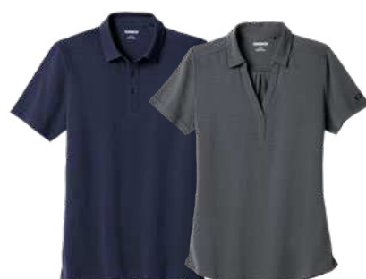
OGIO® LIMIT POLOS 5.6-ounce, 58/38/4 cotton/polyester/spandex OG138 | XS-4XL | 6 colors LOG138 | Women's XS-4XL | 6 colors