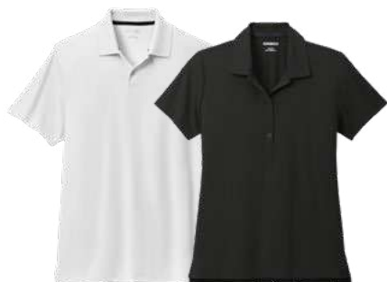
OGIO® REGAIN POLOS 5-ounce, 88/12 recycled poly/recycled spandex OG170 | XS-4XL | 8 colors LOG170 | Women's XS-4XL | 6 colors