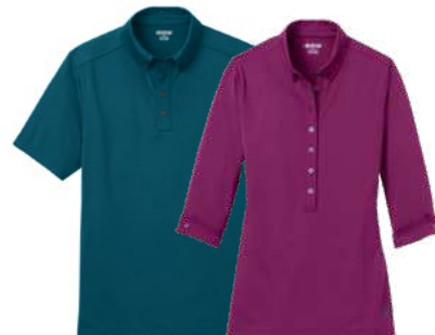
OGIO® GAUGE POLOS 5.9-ounce, 94/6 polyester/spandex OG122 | XS-4XL | 5 colors LOG122 | Women's XS-4XL | 6 colors