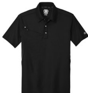
OGIO® ACCELERATOR POLO 5-ounce, 100% polyester pique OG102 | XS-4XL | 3 colors