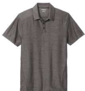
OGIO® SLATE POLO 5.2-ounce, 90/10 polyester/spandex OG143 | XS-4XL | 3 colors