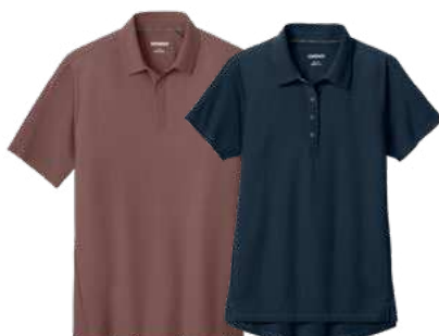
OGIO® ENVISION POLOS 4.9-ounce, 88/12 nylon/spandex micropique with stay-cool wicking technology OG154 | XS-4XL | 6 colors LOG154 | Women's XS-4XL | 5 colors