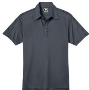
OGIO® HYBRID POLO 4.9-ounce, 100% polyester OG109 | XS-4XL | 3 colors