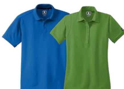
OGIO® CALIBER2.0 POLO 5-ounce, 100% polyester pique OG101 | XS-4XL | 13 colors