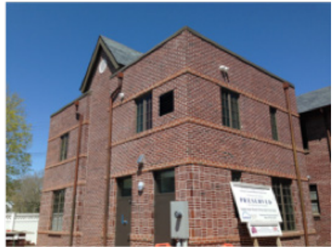
THE NEW EXTENSION

Needless to say, the members of the Preservation Alliance are very proud of the results achieved in our and our many partners efforts to save, restore, expand and improve the historic Duggan Memorial First Aid & Emergency Building of Spring Lake. We see this as a wonderful example of the importance of our mission, to recognize and save the historic buildings in Spring Lake, and we all look forward to a new lifetime of public use for Duggan Hall.