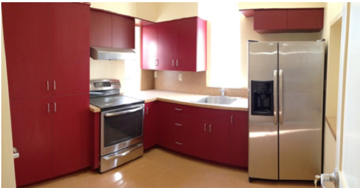
THE NEW KITCHEN