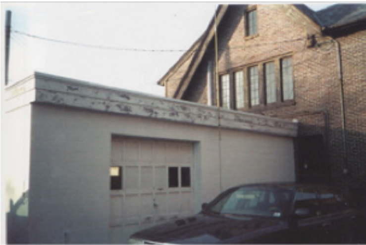
THE OLD EXTENSION