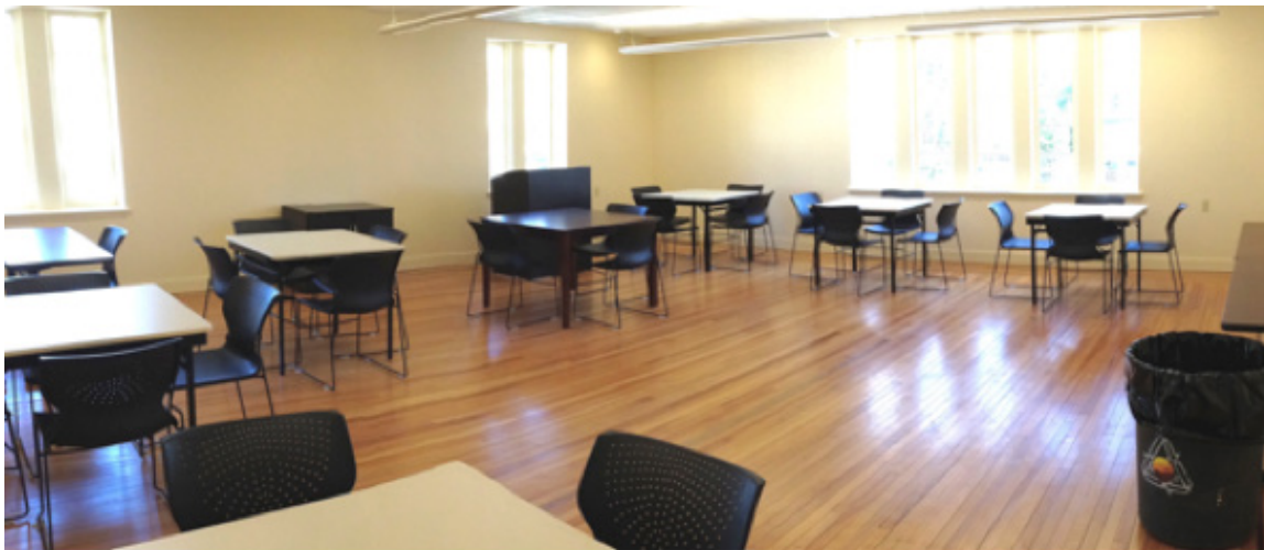
THE SECOND FLOOR MEETING ROOM

With the building up and running, I thought it would be useful to provide a few photos of the spaces, new finishes and amenities now provided in what we now call "Duggan Hall":