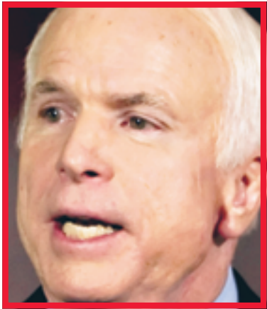
John McCain (R)