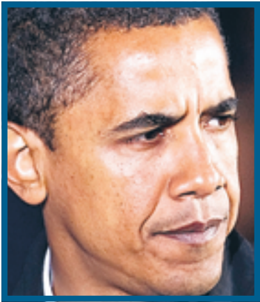
Barack Obama (D)

election districts, and since district boundaries do not always follow village lines precisely, the data are estimates. Figures in the tables are based on returns from polling place locations.