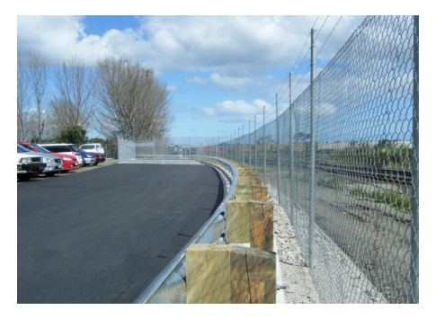
All guardrail systems are crash tested and compliant to NZTA standards.