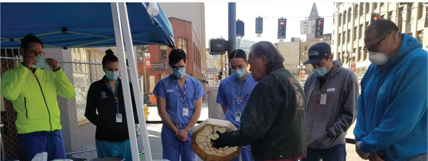
Seattle Indian Health Board First Responders Beginning Their Work With A Blessing

Unfortunately, over 90% of the responses received also indicated that these needs and programmatic areas would experience a “devastating,” if not “very large” negative impact upon our urban American Indian communities as a result of the COVID-19 pandemic. Each of the participating organizations is intimately knowledgeable of the inter-related nature of these needs and anticipates that the lack of services and resources to meet those needs will fuel each other to more significant, and more negative consequences for their respective communities.