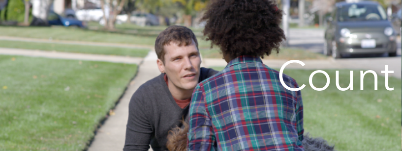
Count to Ten