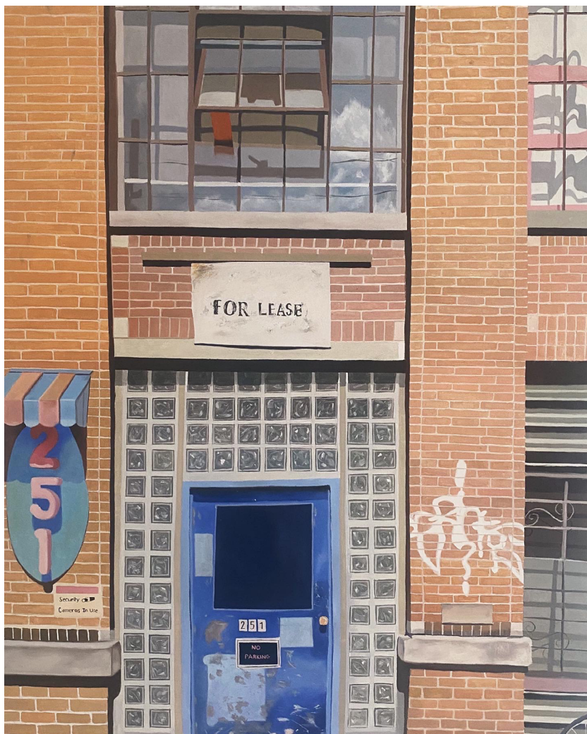
251 Sorauren Jane Forrest