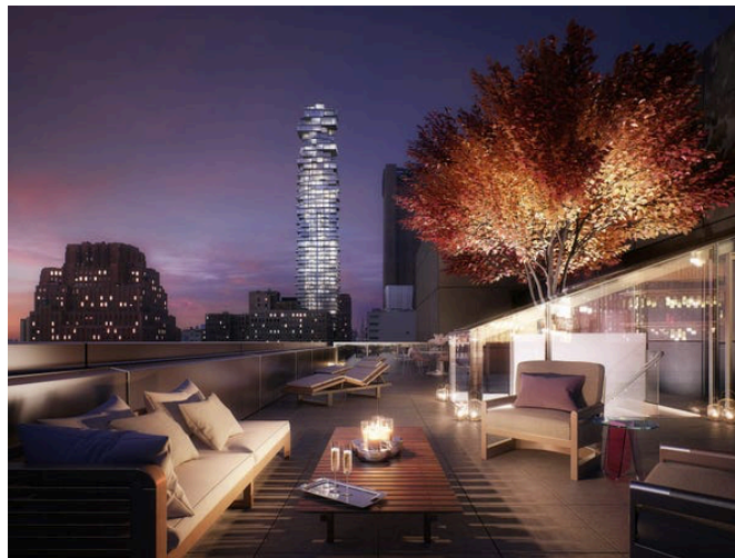
A penthouse terrace at 30 Warren.