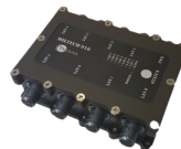
MILTECH 918 Compact Military Gigabit Ethernet Managed Switch - 8 Port