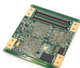
MILTECH 9136 Managed Military Grade Embedded Ethernet Switch - up to 52 ports