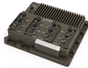
MILTECH 9012 Compact Military Managed 12 Port Gigabit Ethernet Switch/Router