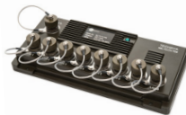
MILTECH 708 Military Fast Ethernet Unmanaged Switch - 8 Port