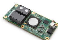
MILTECH 919 Managed Embedded Board Level Ethernet Switch - 8 port with 1 Fiber Optic port