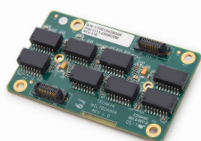
MILTECH 309 Fast Embedded Military Board Level Ethernet Switch (ESoB) - 8 Port