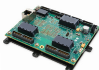
MILTECH 914 Ultra Compact Managed Embedded Board Level Ethernet Switch - 14 Port