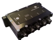
MILTECH 904 Compact Military Gigabit Ethernet managed Switch - 4 Port