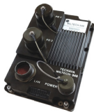
MILTECH 948 Compact, Portable Military Managed Gigabit Ethernet Switch 8 Copper ports +2 Fiber Ports