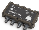
MILTECH 308 Compact Military Fast Ethernet Switch - 8 Port