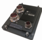
MILTECH 912 Rugged Military Gigabit Ethernet Switch - 12 Port with a single MIL-D-38999 connector