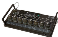
MILTECH 610 Military Fast Ethernet Unmanaged Switch - 8 Port with LED indicators