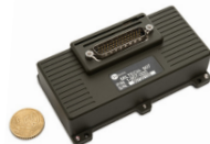
MILTECH 907 Compact, Portable Military Managed Ethernet Switch - 5 Ports and 1 D-Type 44 Pin Connector