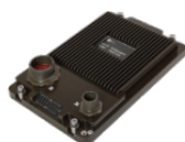
MILTECH 908MP Compact Military Gigabit Ethernet Managed Switch - 8 Port with a single connector