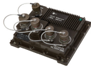
MILTECH 1000 Series Compact, Portable Military Gigabit Media Converters with PoE and Security