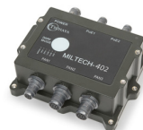
MILTECH 402 Rugged Miniature PoE Ethernet Switch with Power Distribution Capabilities