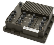
MILTECH 9012C Compact Military Managed 12 Port Gigabit Ethernet Switch/Router with Cisco® IOS® External Connectivity