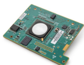
MILTECH 9128 Managed Embedded Board Level 24 port Router/ Switch with 4 x 10G ports