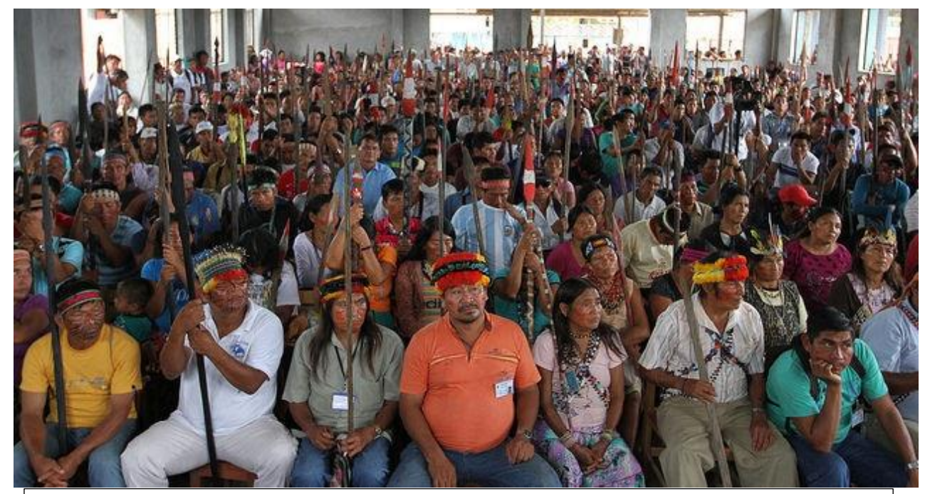
Prior consultation for lot 192 in 2015 at https://www.iwgia.org/en/news/3918-consultation-or-non-consultation-here-lies-the-dilemma.html