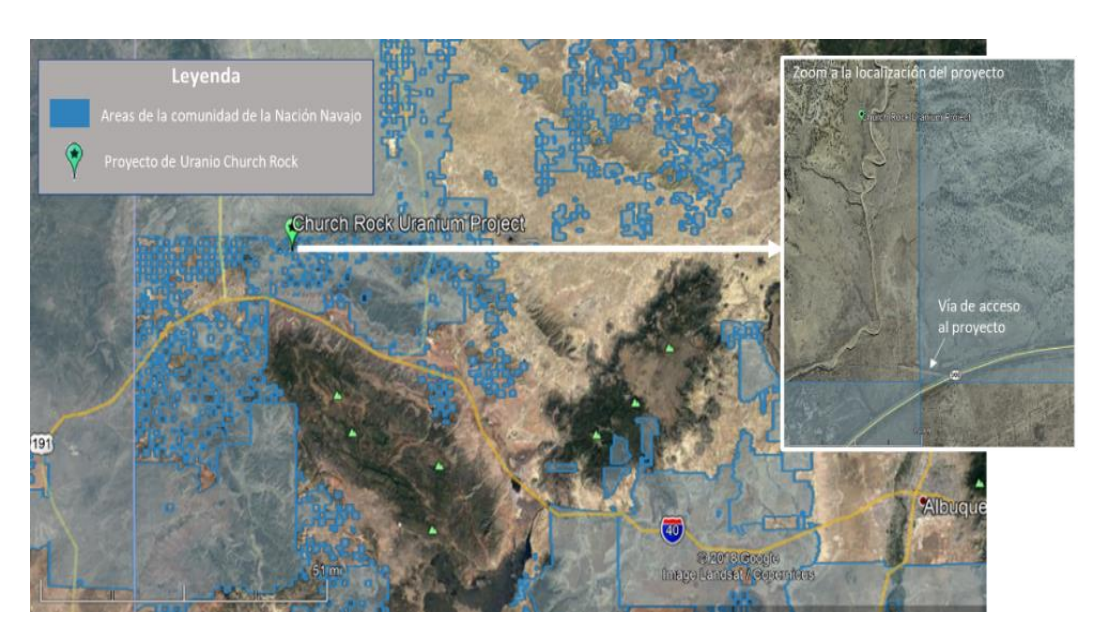
Figure 1 – Location Map of the Uranium Church Rock Project in New Mexico, USA

Uranium Resources Inc., which had been proposing a uranium extraction project since 2012 that required a capital investment of US$35 million. In July 2014, the Navajo Nation decided to quash any discussion on land access and use by this extractive project. Although most of the mineral resource area was not within the Navajo reserve (see Figure 1), it was required to travel through 100 meters of road within the indigenous reservation to access the area. The Navajo community vetoed the passage of this route, so the project has not materially advanced since 2012.