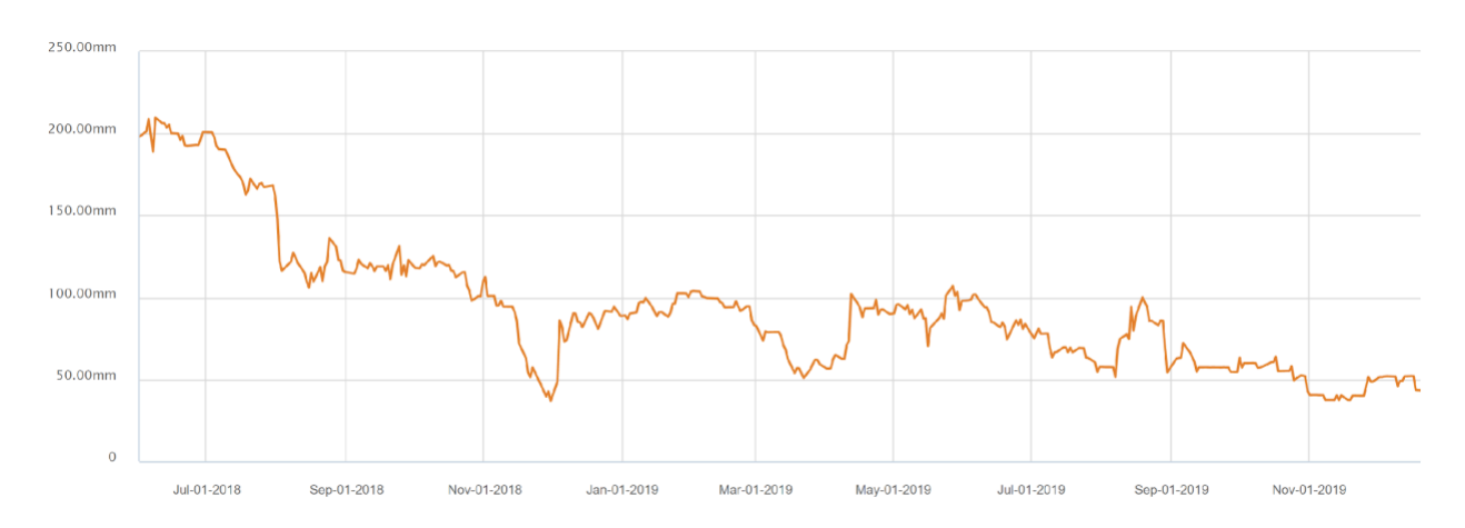
Figure 3 – Market Capitalization between Jun 2018 and Dec 2020 for Lydian International Limited.

In Amulsar's case, Lydian International lost close to $150 million in market capitalization from community blockades and being delisted from the Toronto Stock Exchange in December 2020. The position of its two largest owners, with a 46.6% (June 2018) share of ownership, declined significantly, and the company's value possibly reached an almost unrecoverable point. At Lydian International, its two significant investors had already invested more than $300 million in advancing the construction of this gold project.