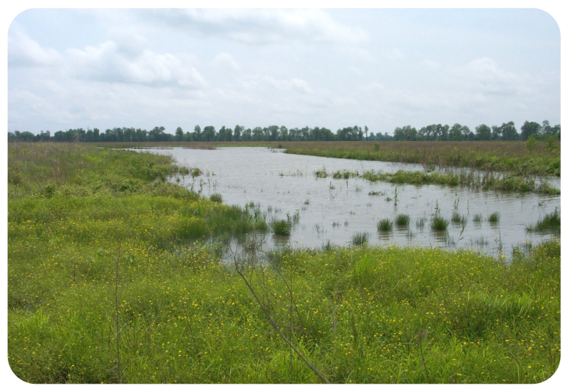
Photos: top Mallard closeup by Fyn Kynd Photography, Flickr CC 2.0; Permanent Wetland Reserve Easement in Sunflower County, MS by NRCS; Wetland Reserve easement in Mississippi by NRCS

Watch a video on how to get started with NRCS!