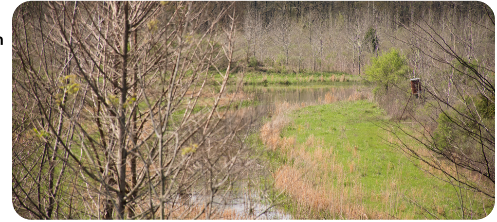
Photos: top Mallard closeup by Fyn Kynd Photography, Flickr CC 2.0; Hunter and dog courtesy of Bob Bush; Spring green-up on Wetland Reserve acreage in the Mississippi Alluvial Valley by NRCS