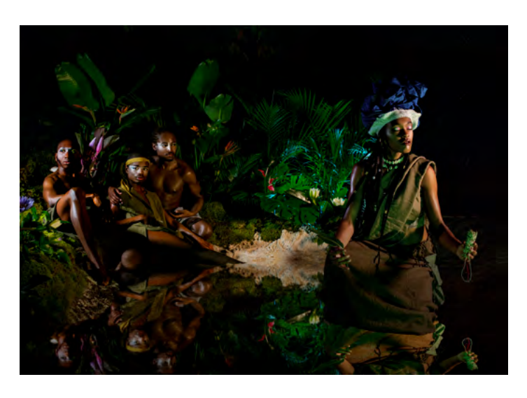
Christopher Udemezue, Untitled (In a trance, she walked out onto her reflection, closed her eyes and received a plan from beyond the mountains), 2017. Digital print.

but the photograph illuminates his choice to present a disarmed whiteness and center the beauty of Black queerness. In lieu of offering a narrative of white savior and Black victim, Udemezue emphasizes Black power in and through connection and the desperation of isolation—produced in this context by Beckford's flight to Jamaica after being exiled for queer