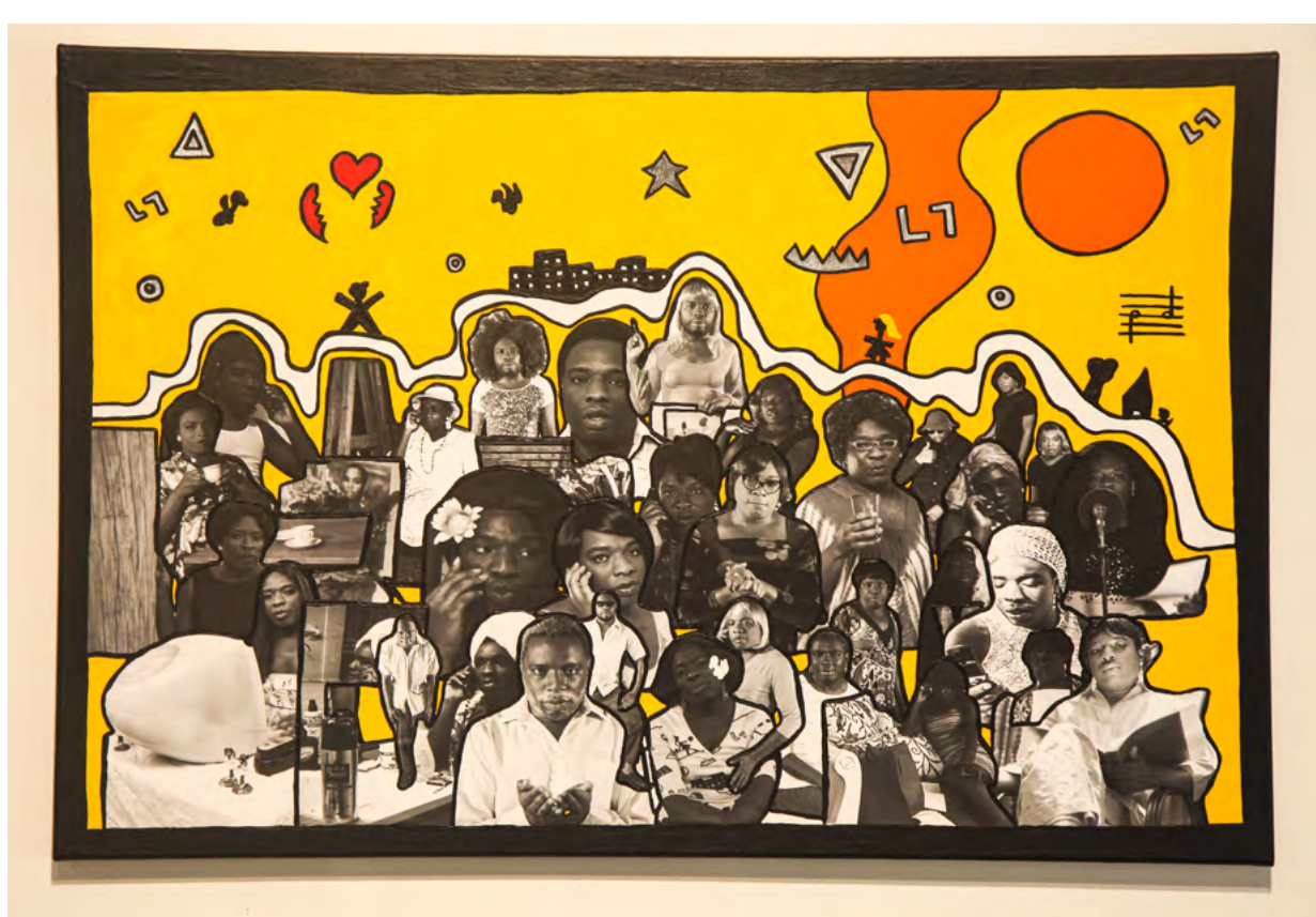
Kalup Linzy, Resemblance, 2018. Mixed media on canvas.

comfortable form of collectivity. Instead, she finds power in friction, arguing that difference is actually the condition of being in solidarity because it allows one to acknowledge interdependence. Lorde writes, "Only within that interdependency of different strengths, acknowledged and equal, can the power to seek out new ways of being in the world generate, as well as the courage and sustenance to act where there are no charters." The act of coming together