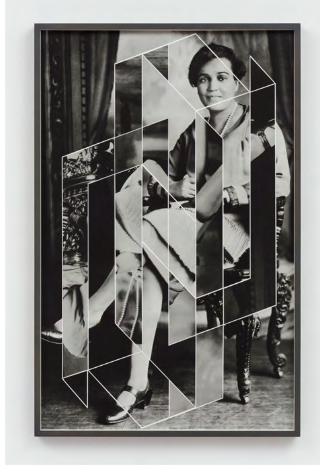
And rea~Geyer, Constellations (Jessie~Redmon~Fauset), 2018.~Hand-cut~archival~print~on~rag~paper.~Courtesy~of~the~artist~and~Hales~Gallery, London~and~New~York.~@~Andrea~Geyer.

Andrea Geyer's Constellations series activates similar dynamics in approaching photographs of others. These are not images of people who the artist knows they are early 20th century figures in queer cultural and activist circles, but they are connected to Geyer in their politics and affinity for collectivity. This form of affective proximity and historical distance is cemented aesthetically by her personalization of archival photographs, with complex geometric cuts and rearrangements to announce a kinship beneath the surface. Constellations (Jessie Redmon Fauset), 2018, for example, transforms Fauset's seated body through the addition of vertical