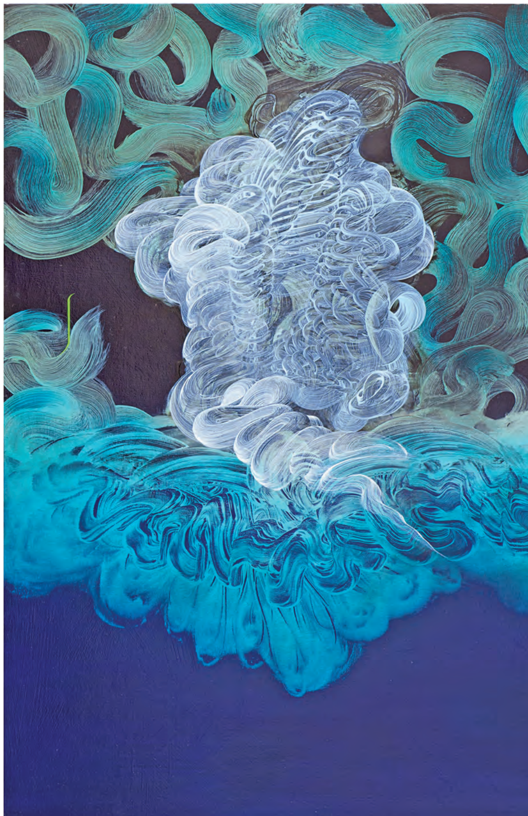
Suzi Morris, "Burden of the Dendrite," 2017. Oil on aluminium, 61 X 46 cm

I've also come to understand how the influence of the new sciences and genomics is as key to situating my practice as the discovery of microbes, X-rays and unseen