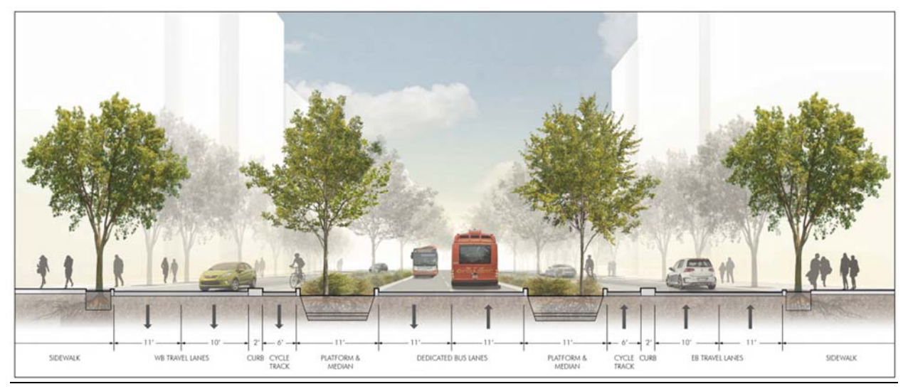
K Street Transitway April 2020 Preliminary Design.

The proposed capital budget allocates $57,008,000 in FY 2023, which combined with the existing allotment balance of $59,259,000, fully funds the K Street Transitway Project, and will enable construction in FY 2023 and 2024. These funding levels and timelines are largely intact from the approved FY 2022 budget.