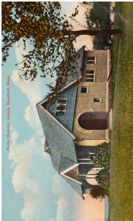
Porter Memorial Library

A half mile equals approximately 1,000 steps based on an average person's height, weight and moderate pace.