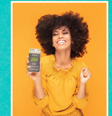
9601 Jones Rd