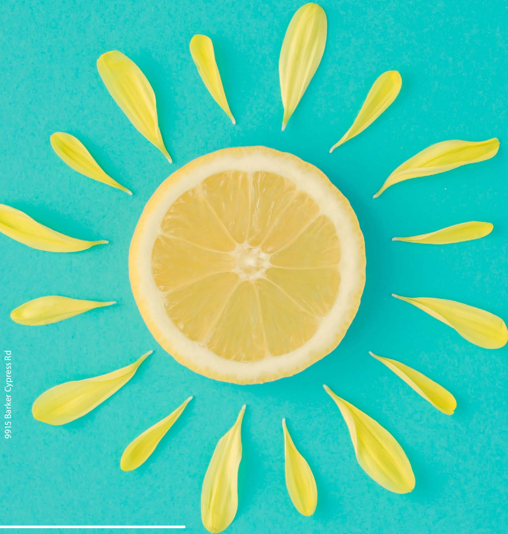
9915 Barker Cypress Rd