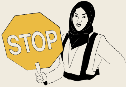
Traffic accident investigators, unarmed traffic monitors