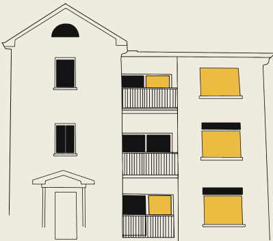
Outreach workers, housing providers