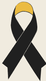
Domestic and intimate partner violence response