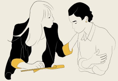
Mental health professionals and peer support