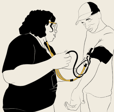
Substance use counselors, street nurses, injection sites, peer recovery outreach