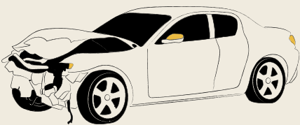
Accident response and traffic enforcement