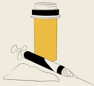
Drug use and overdose response