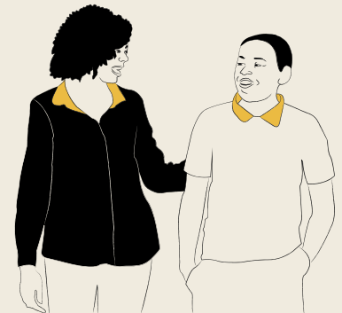
Peer "walking counselors"