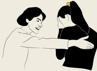
Trained domestic violence counselors, de-escalators, and crisis intervention teams