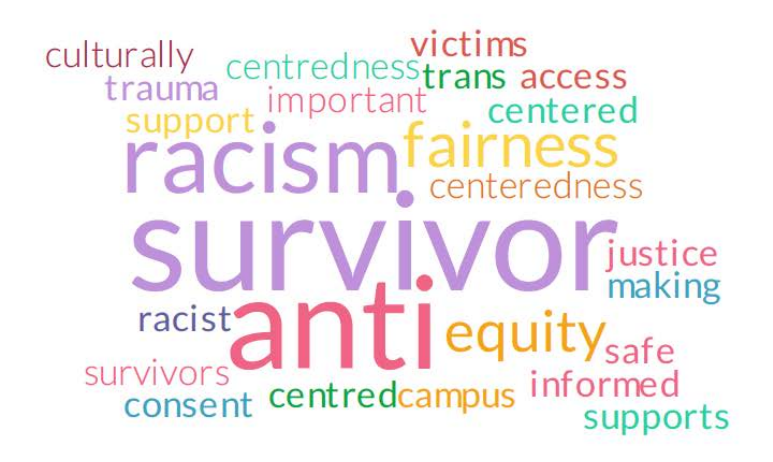
Figure 2: Principles for campus work on gender-based violence (NAP student survey).