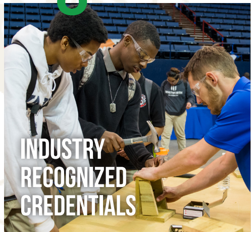
INDUSTRY RECOGNIZED CREDENTIALS

The Career Expo provides freshmen from across the city an interactive experience with available career and training opportunities in digital media/IT, health sciences, and skilled crafts. Thanks to over 75 employers and training providers, the 2018 Expo introduced 2,200 students to job opportunities in growing and lucrative career pathways.