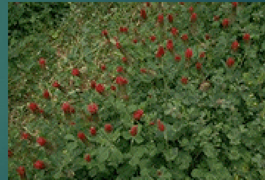
Crimson clover 1 - 2 lbs.