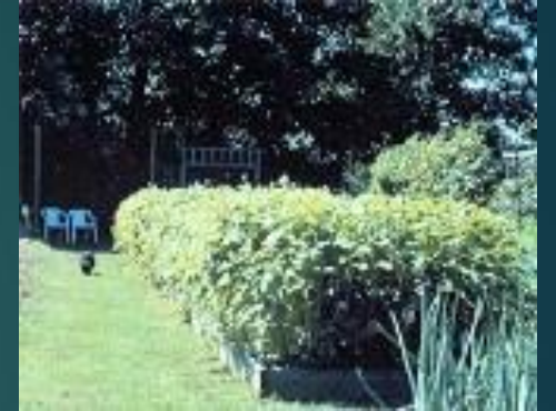
Buckwheat 2 lbs.