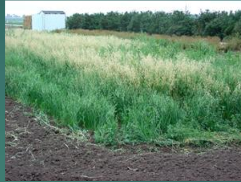
Annual rye 2 - 3 lbs.