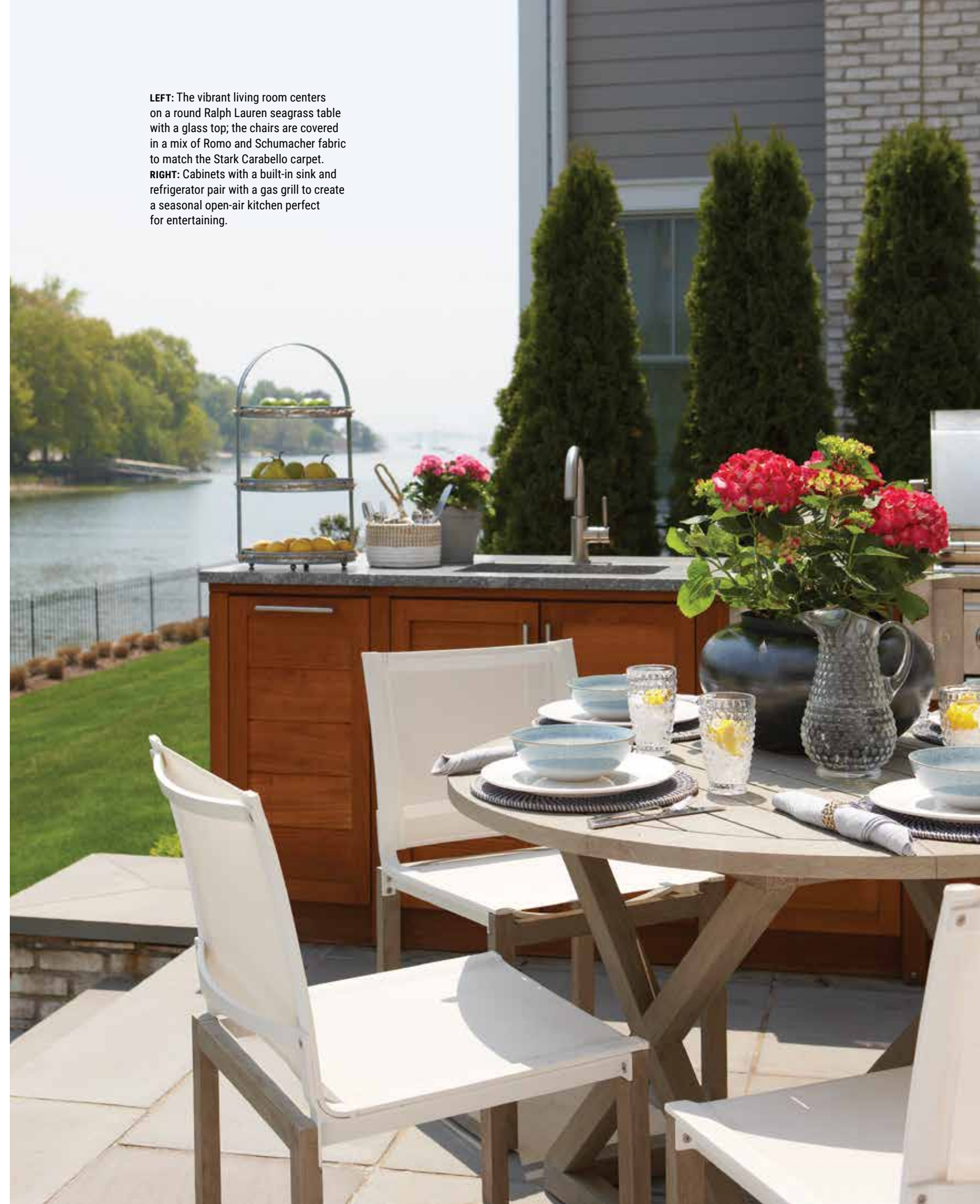
LEFT: The vibrant living room centers on a round Ralph Lauren seagrass table with a glass top; the chairs are covered in a mix of Romo and Schumacher fabric to match the Stark Carabello carpet. RIGHT: Cabinets with a built-in sink and refrigerator pair with a gas grill to create a seasonal open-air kitchen perfect for entertaining.