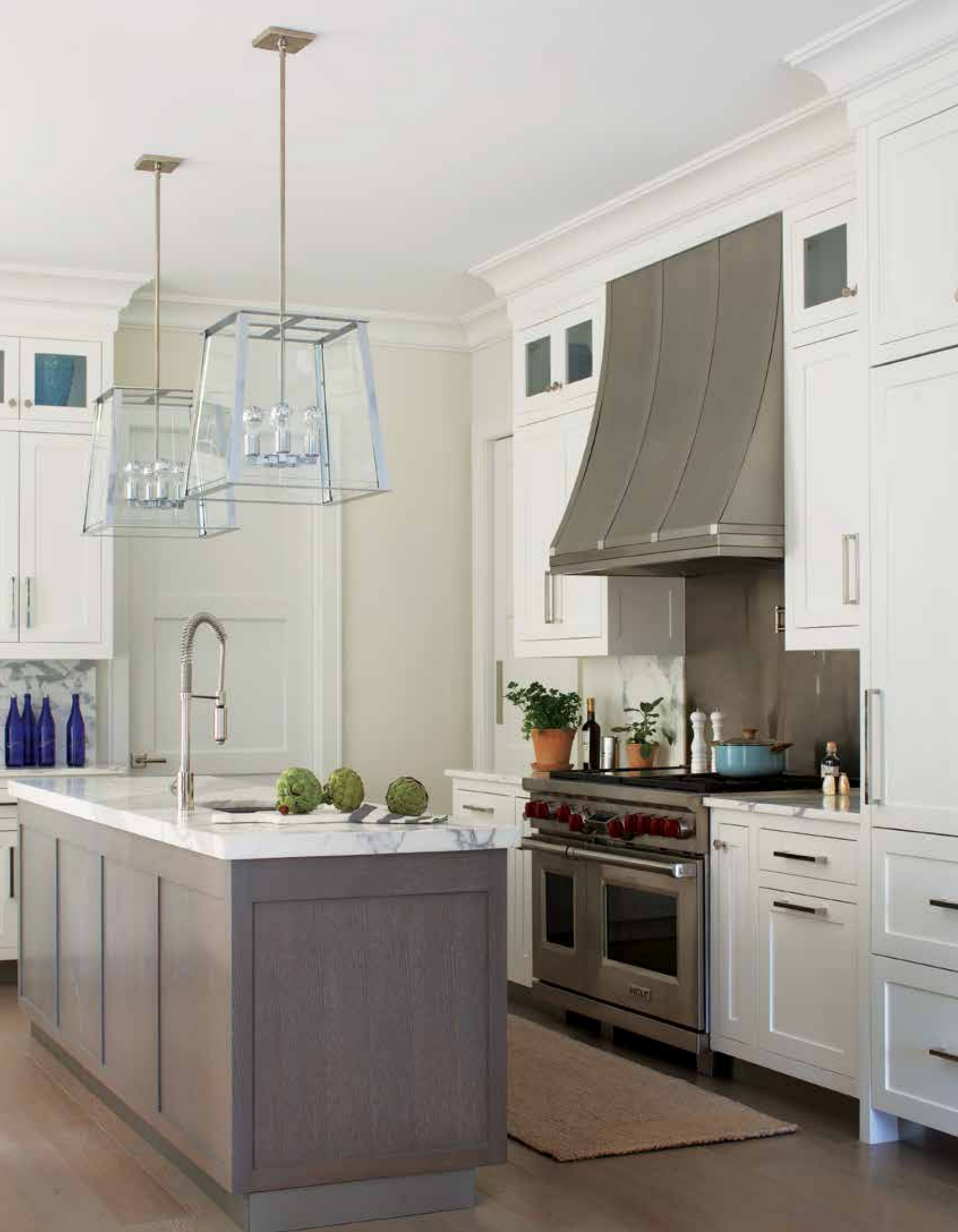
RIGHT: A built-in banquette cozies up to a glass-topped table in the breakfast nook. LEFT: A sloped custom range hood and a pair of Geo Lantern pendants from Ilex Lighting are the eye-catching features of the kitchen. The cabinetry has backlit glass cutouts displaying keepsakes.