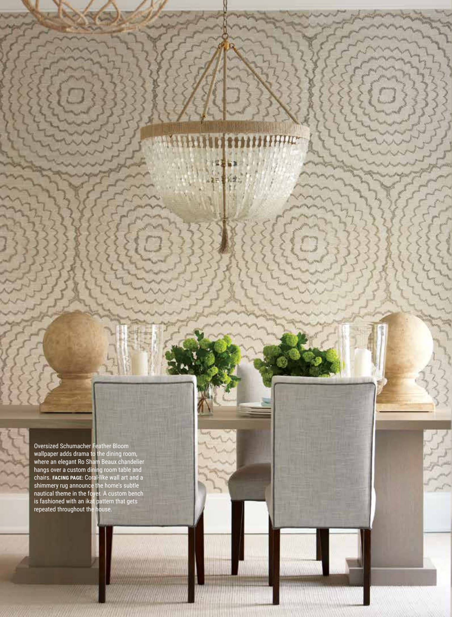
Oversized Schumacher Feather Bloom wallpaper adds drama to the dining room, where an elegant Ro Sham Beaux chandelier hangs over a custom dining room table and chairs. FACING PAGE: Coral-like wall art and a shimmering rug announce the home's subtle nautical theme in the foyer. A custom bench is fashioned with an ikat pattern that gets repeated throughout the house.