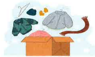
Coats for Kids

The money earmarked for Ware Elementary has been sent to the school for school supplies and child enrichment needs.