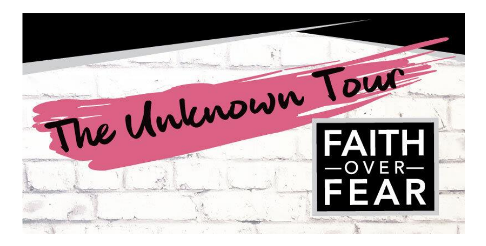
The Unknown Tour is a Christian women's event packed with fun, clean comedy, worship & encouragement focused life's unknowns.

Central Baptist Church - Carthage, Texas Friday. February 2nd, 2024 7:00 PM - 9:30 PM