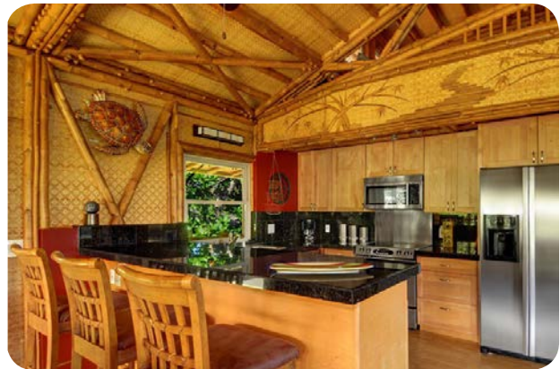
Kitchen with custom bamboo artwork above cabinets.