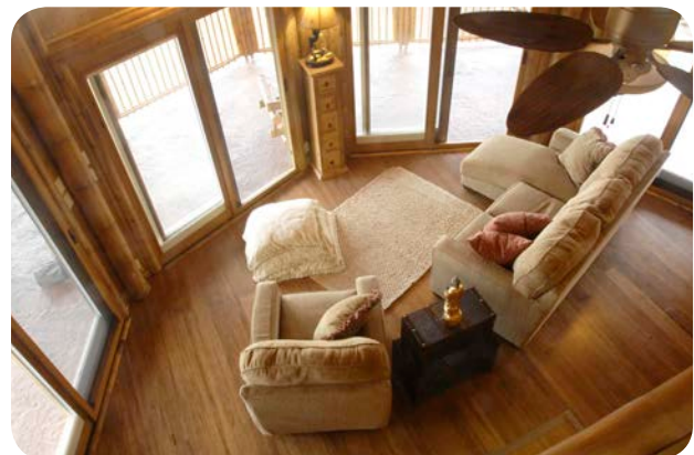
Loft view of living room. Sliders open to wrap-around lanai.