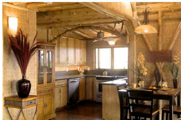
Signature Pacific 992 kitchen with woven bamboo wall finish.