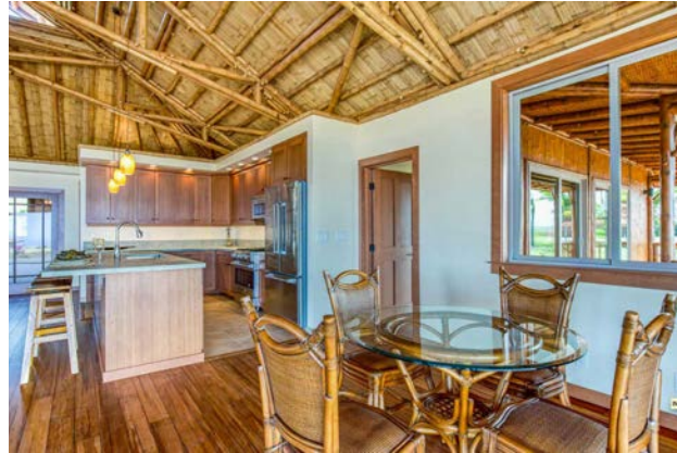
Hybrid Villa 1950 conventionally-framed walls with smooth interior.