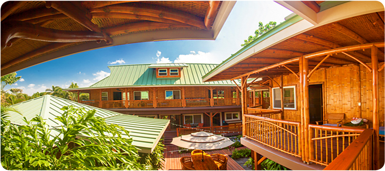
Multi-unit luxury vacation rental property comprised of four Bamboo Living structures connected by walkways.