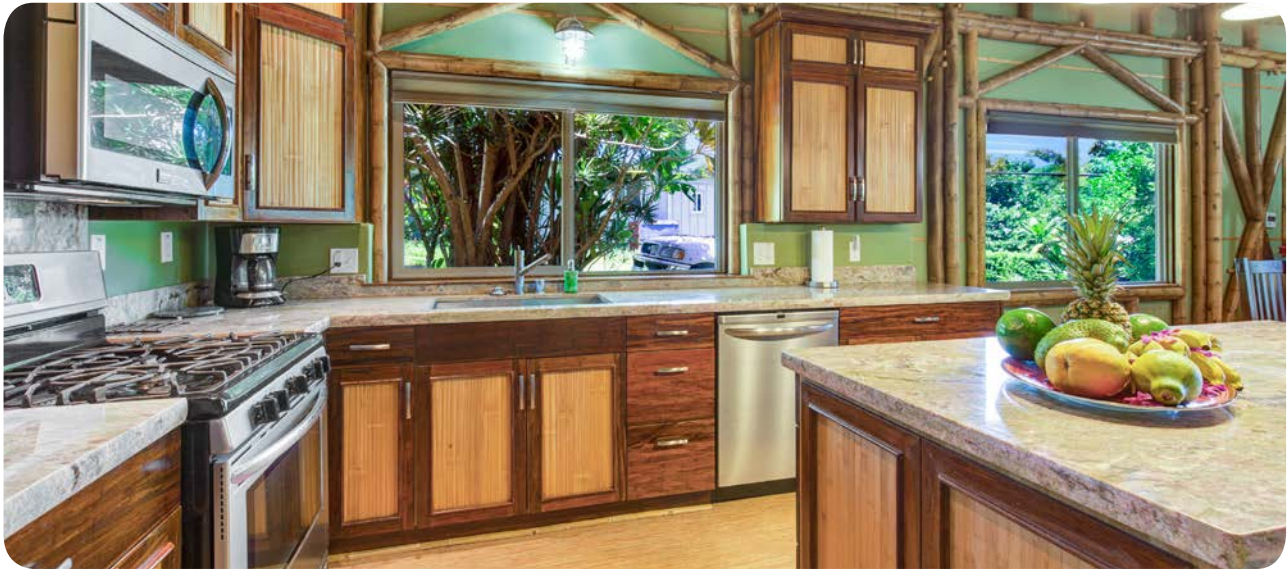
Custom Signature 2-Story Bali. 3 bedrooms, 3 baths with a total of 2082 sf interior and 862 sf covered porch.