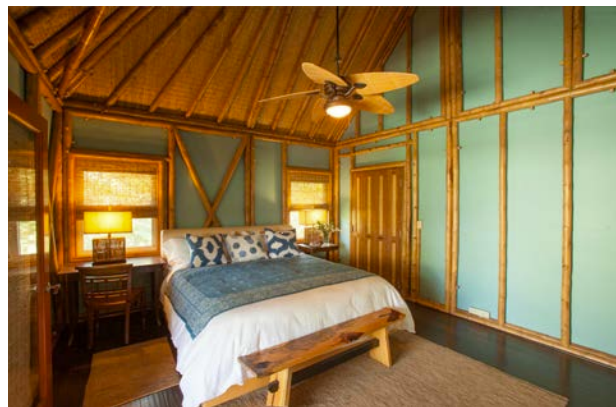
Signature Poly 1619 bedroom with woven bamboo ceiling finish.