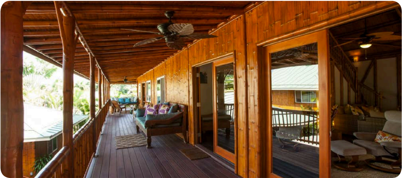
Signature Polynesian 1619 front porch with split bamboo exterior siding, bamboo porch posts, railing, and pickets.