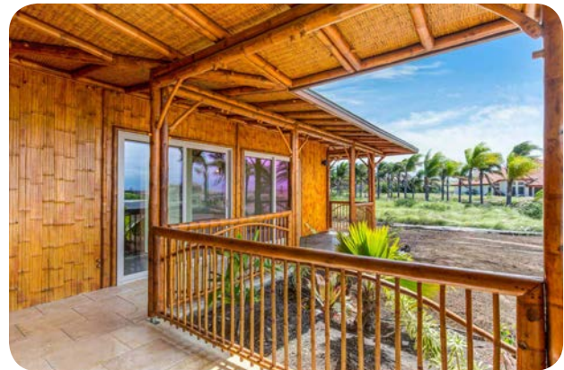
Split bamboo siding and loose weave porch ceiling finish.