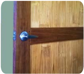
interior bamboo doors