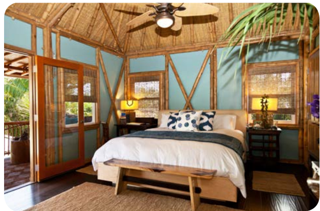
Master suite with woven bamboo ceiling and painted walls.