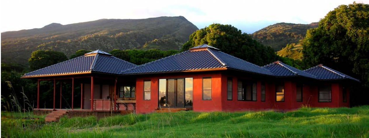
Custom bamboo home with Japanese glazed tile roof, Italian stucco finish, and exposed interior vaulted bamboo ceiling.