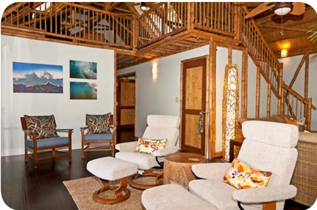
Painted walls with bamboo ceiling and stairway to loft.