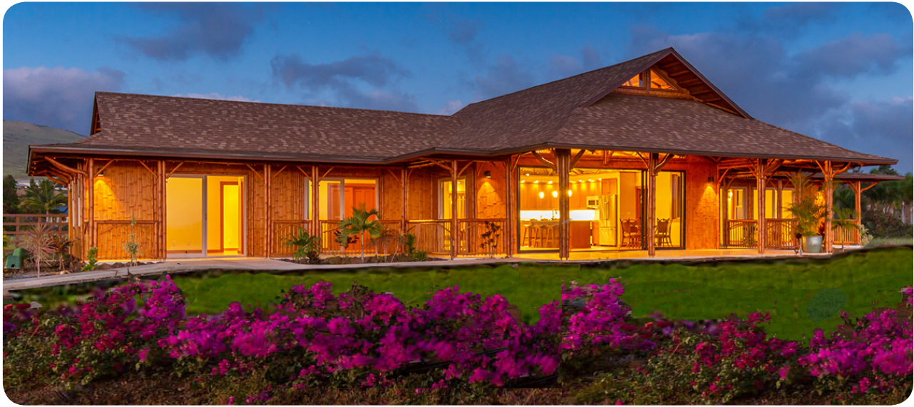
Hybrid Villa 1950 - 3 Bedroom, 2.5 Bath. Central great room opens to a generous lanai with travertine stone floor.