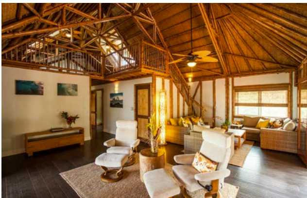
Signature Poly 1619 with woven bamboo ceiling and painted walls.