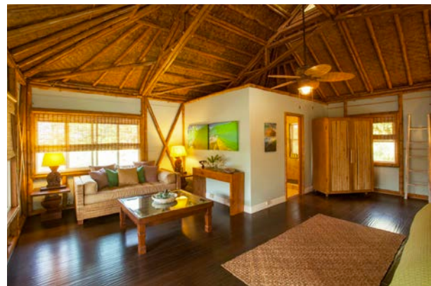
Signature Bali 576 living area and corner bathroom.