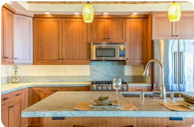
Contemporary, spacious kitchen with high-end finishes.