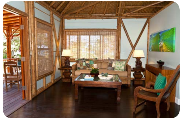
Signature Bali 576 sitting area with painted walls.