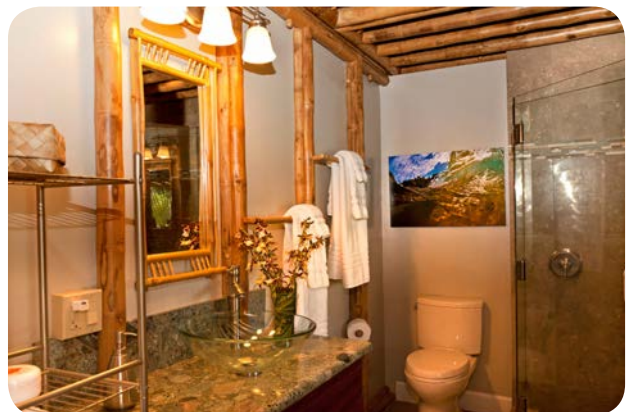
Master bath with beautiful exposed bamboo.