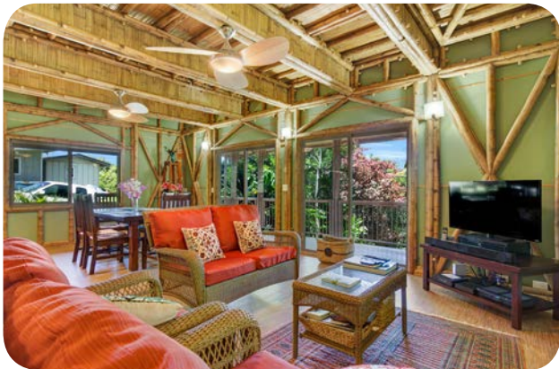
Living area with exposed bamboo and painted walls.