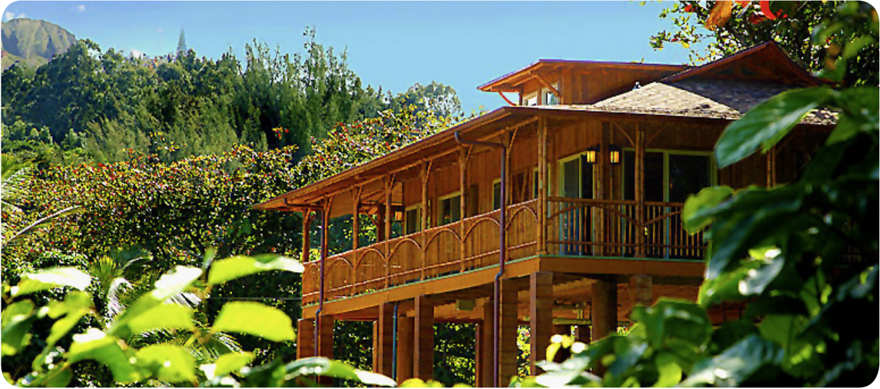
Custom Signature Bali on raised 17' tsunami foundation. 2 bedrooms, 2 baths, and a private residential elevator.