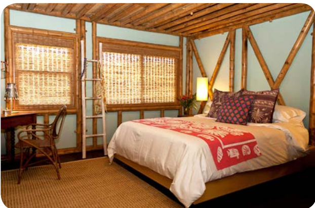
Guest bedroom with exposed bamboo x-braces.