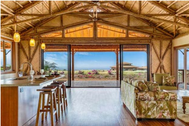
Hybrid Villa 1950 great room with split bamboo ceiling finish.