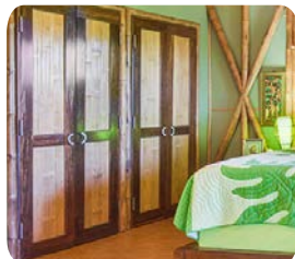
interior closet doors