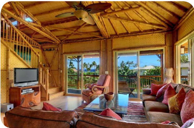
Woven bamboo finishes on walls and ceilings.