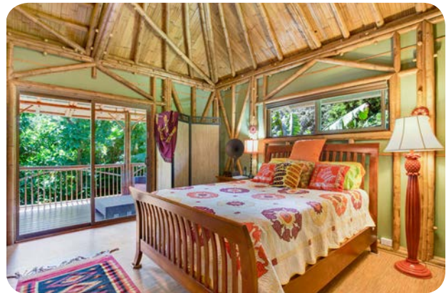
Guest bedroom with split bamboo ceiling finish.