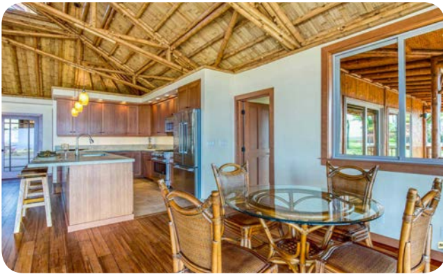
Hybrid Villa 1950 - conventional walls with split bamboo ceiling finish.