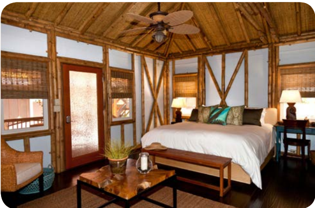
Signature Zen 400 studio with woven bamboo ceiling.