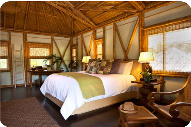
Signature Bali 576 studio with woven bamboo ceiling.