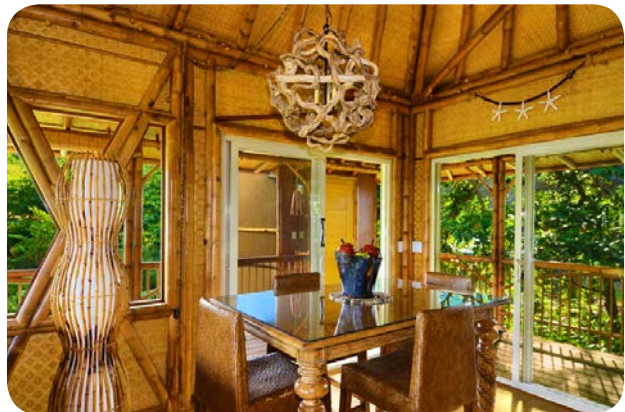
Dining area with exposed bamboo x-braces and trusses.