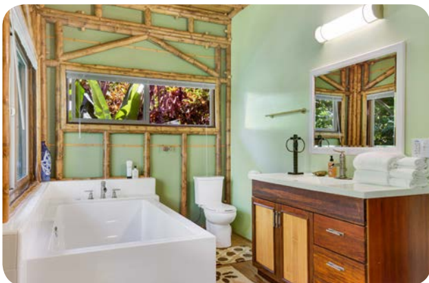
Bath with painted walls and bamboo cabinets.