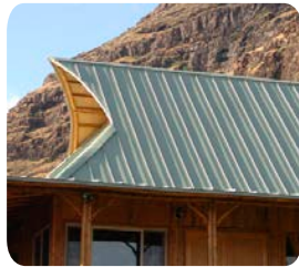
flying gable roof