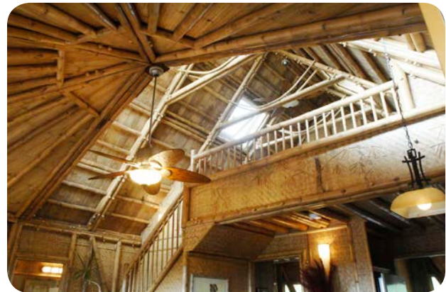
View of loft and beautiful exposed bamboo trusses.