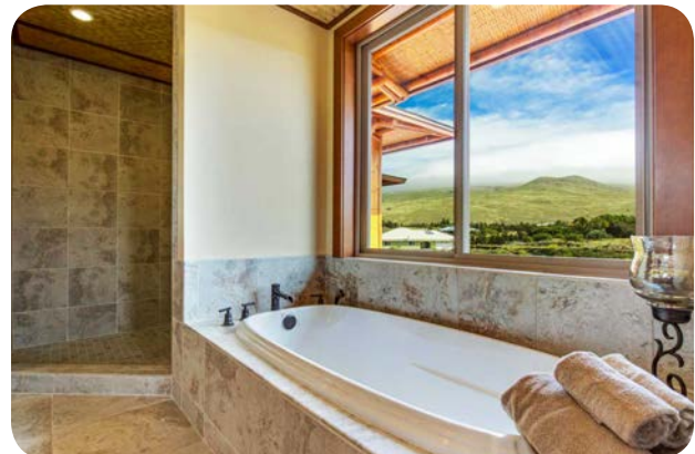
Beautiful views from the master bath garden tub.