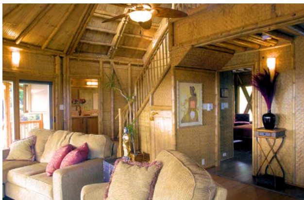
Signature Pacific 992 living area with split bamboo ceiling finish.