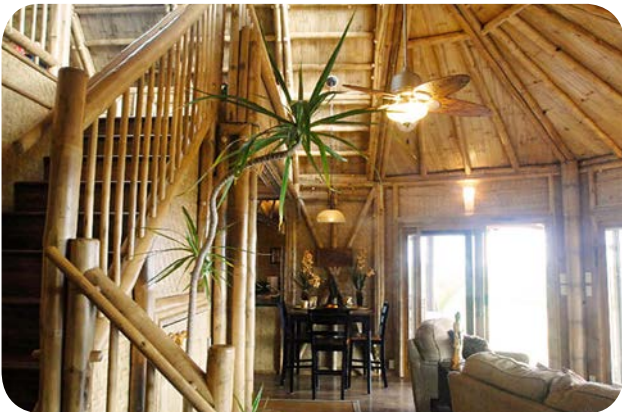
Split bamboo ceiling finish and woven bamboo walls.