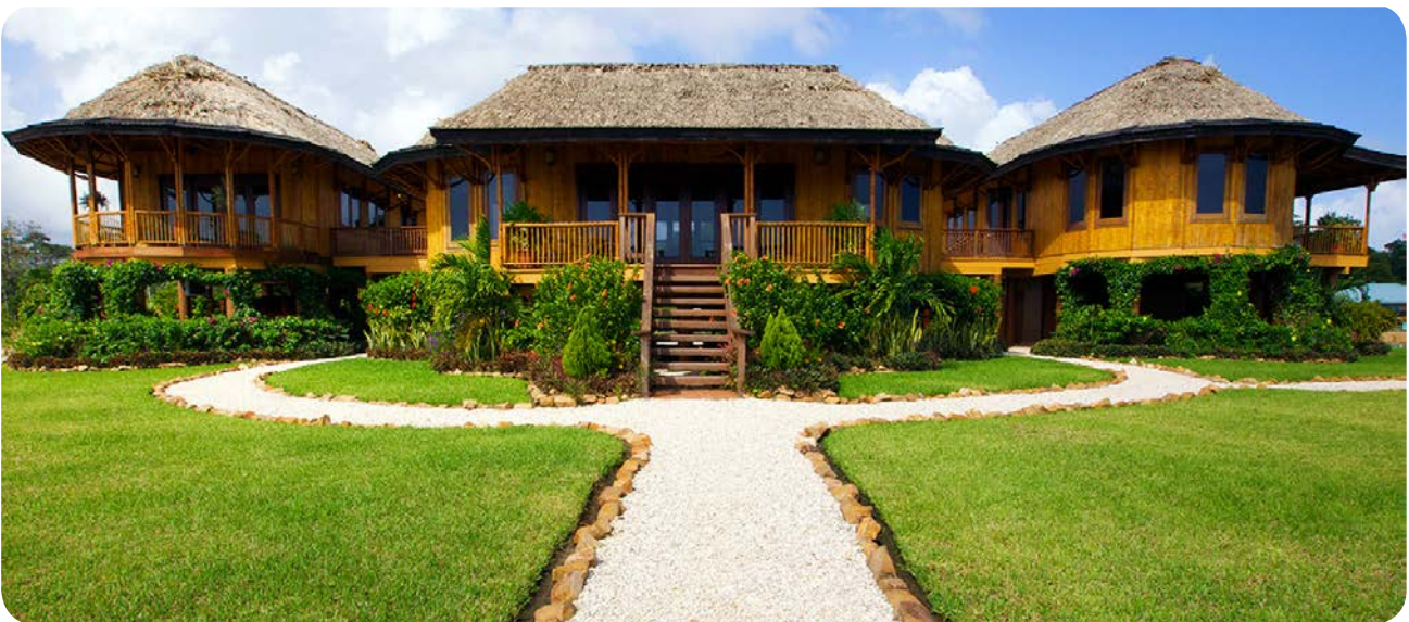
Signature Celestial 3 with thatch roofing.

Signature Home Packages are great for temperate climates with building codes that allow single-wall construction. Your package includes bamboo-framed exterior single-wall panels, complete with our natural split bamboo exterior siding. Select your interior wall finish, either: paint color of your choice, woven bamboo, or split bamboo, and enjoy beautiful exposed bamboo throughout.