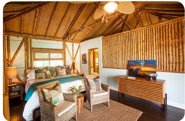
Signature Zen 768 bedroom with woven bamboo ceiling.