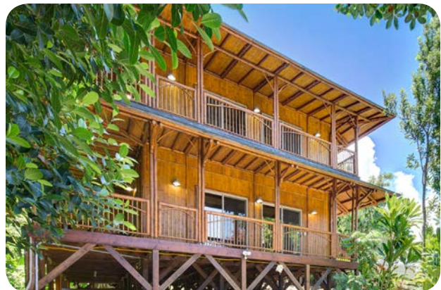
Exterior view with spacious covered porches.