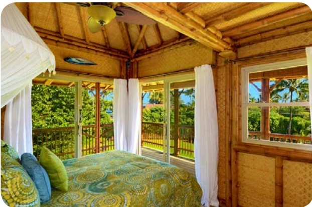
Guest bedroom with lanai entrance and expansive views.