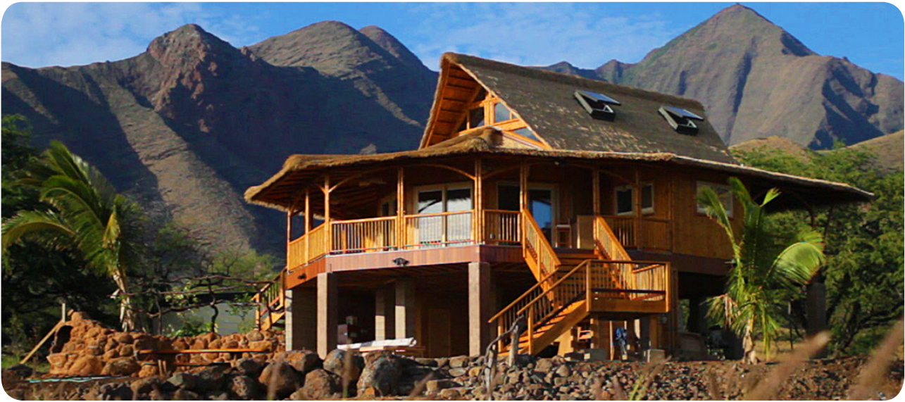
Signature Pacific 992 with synthetic thatch roofing and skylights, on post and pier foundation.