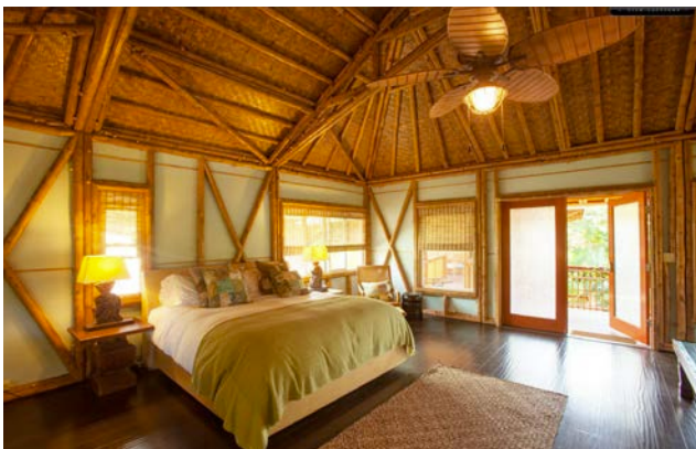
Signature Bali 576 woven bamboo ceiling finish with painted walls.