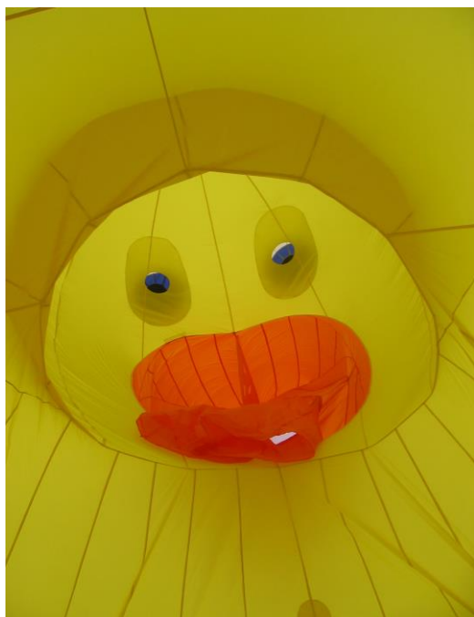
A view from inside “What the Duck”