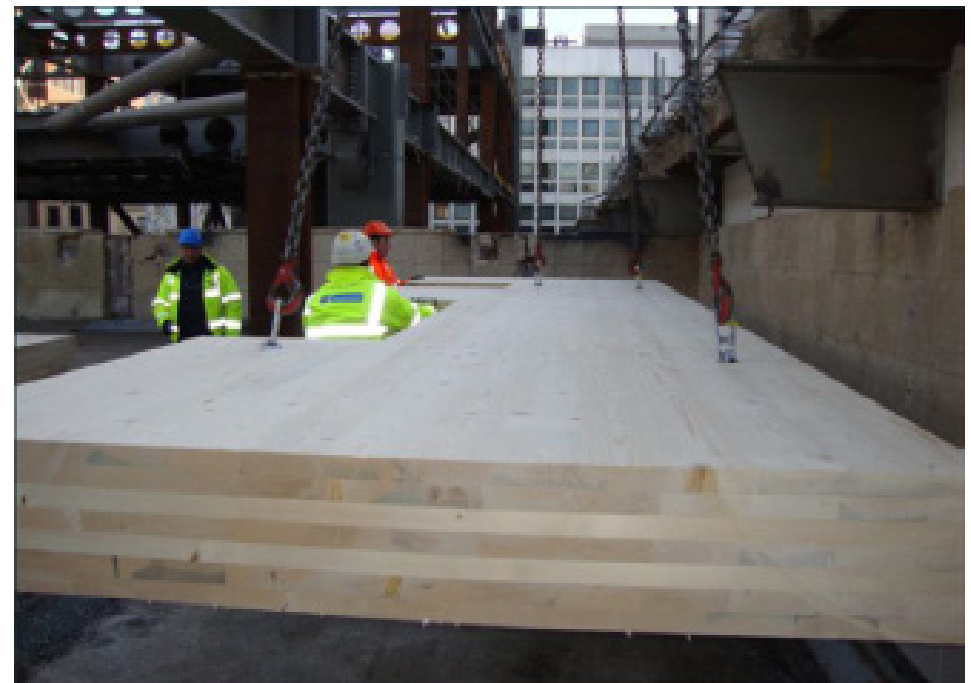
Foggo Associates with Laing O'Rourke